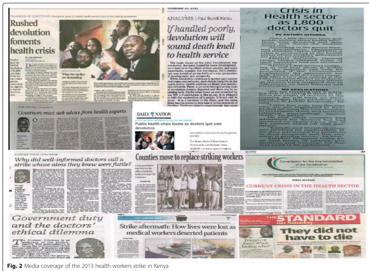
Fig. 2 Media coverage of the 2013 health workers strike in Kenya

national media continued to report on cases of mass resignations of health workers countrywide. In late 2013 the three major health worker unions in the country called for a nation-wide strike citing these challenges and pressing for re-centralization of the health service delivery function back to national government. During this strike, which lasted for several weeks, health care workers countrywide resorted to several protest strategies including street demonstrations and social media protests (Fig. 2).