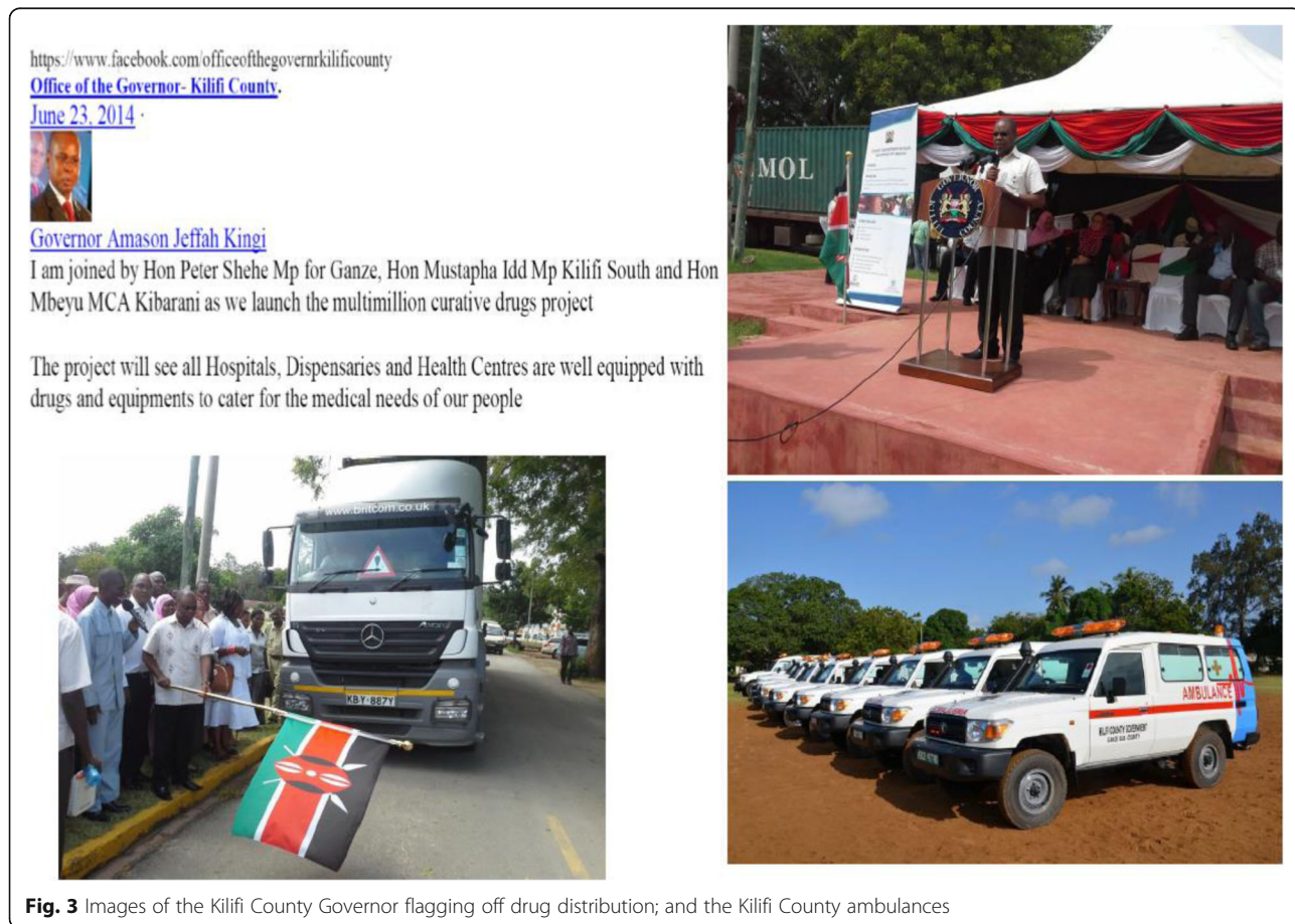
Fig. 3 Images of the Kilifi County Governor flagging off drug distribution; and the Kilifi County ambulances

Omar [4] argued that the political drivers and context that push a country to adopting decentralized governance arrangements have a major bearing on how decentralization gets implemented in that setting [4]. From our findings, the political context in Kenya caused the transfer of devolved health sector functions to be done faster than had been anticipated by most health sector players (Tsofa B, et al.: How does decentralisation affect health sector planning and financial management? A case study of early effects of devolution in Kilifi County, Kenya, submitted) [25]. This happened at a time when the county governments had not set up their organizational structures and built capacity for these structures to undertake their functions, causing