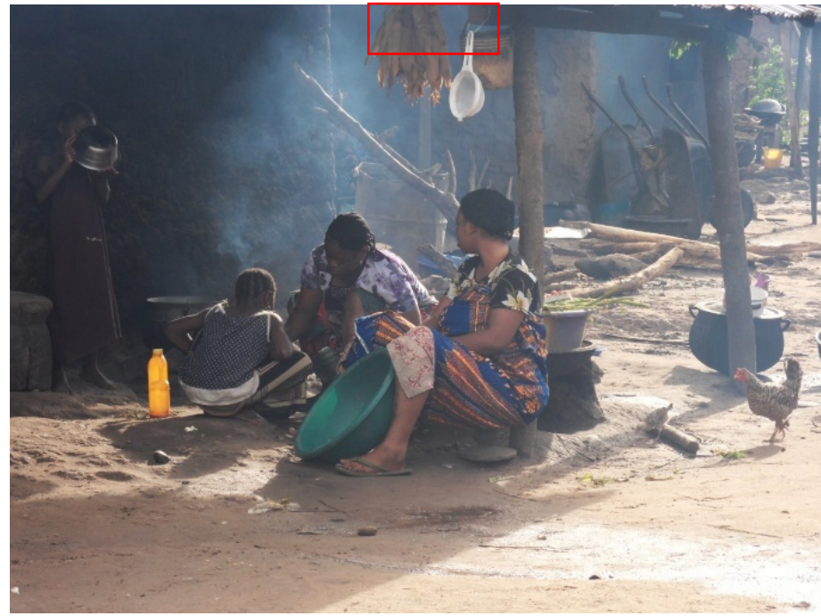
Figure 3: Food processing on a mesh tray and food preservation above kitchen area