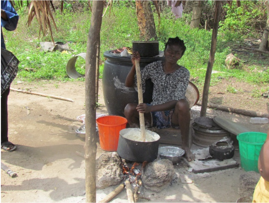
Figure 2: Three stone fire cooking place