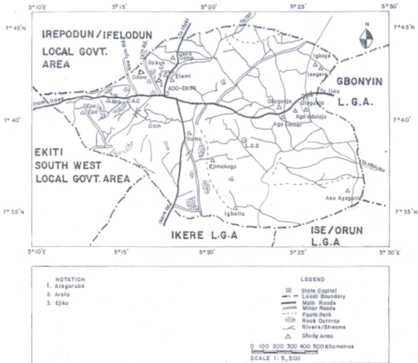
Figure 1: Maps of Ekiti State and communities that participated in the study