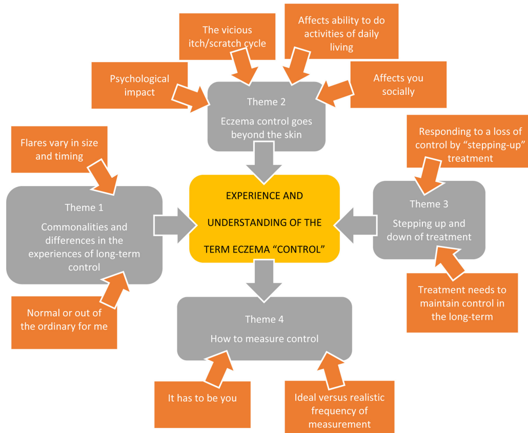
Figure 2 Mapping of the thematic framework.

If I catch a minor flare quickly enough I can sometimes control the irritation before it get completely out of control to what I call a meltdown. (Participant 5, group 1, female, aged 20 years)