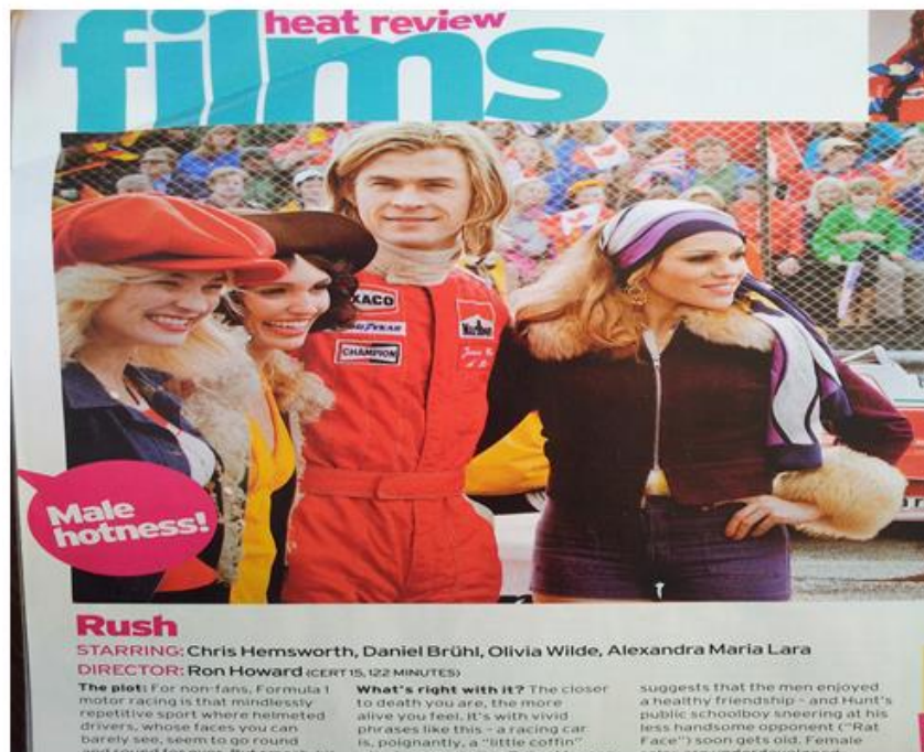
Figure 3: Tobacco in TV and film