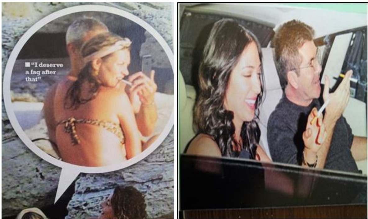
Figure 1: The celebrity smoker