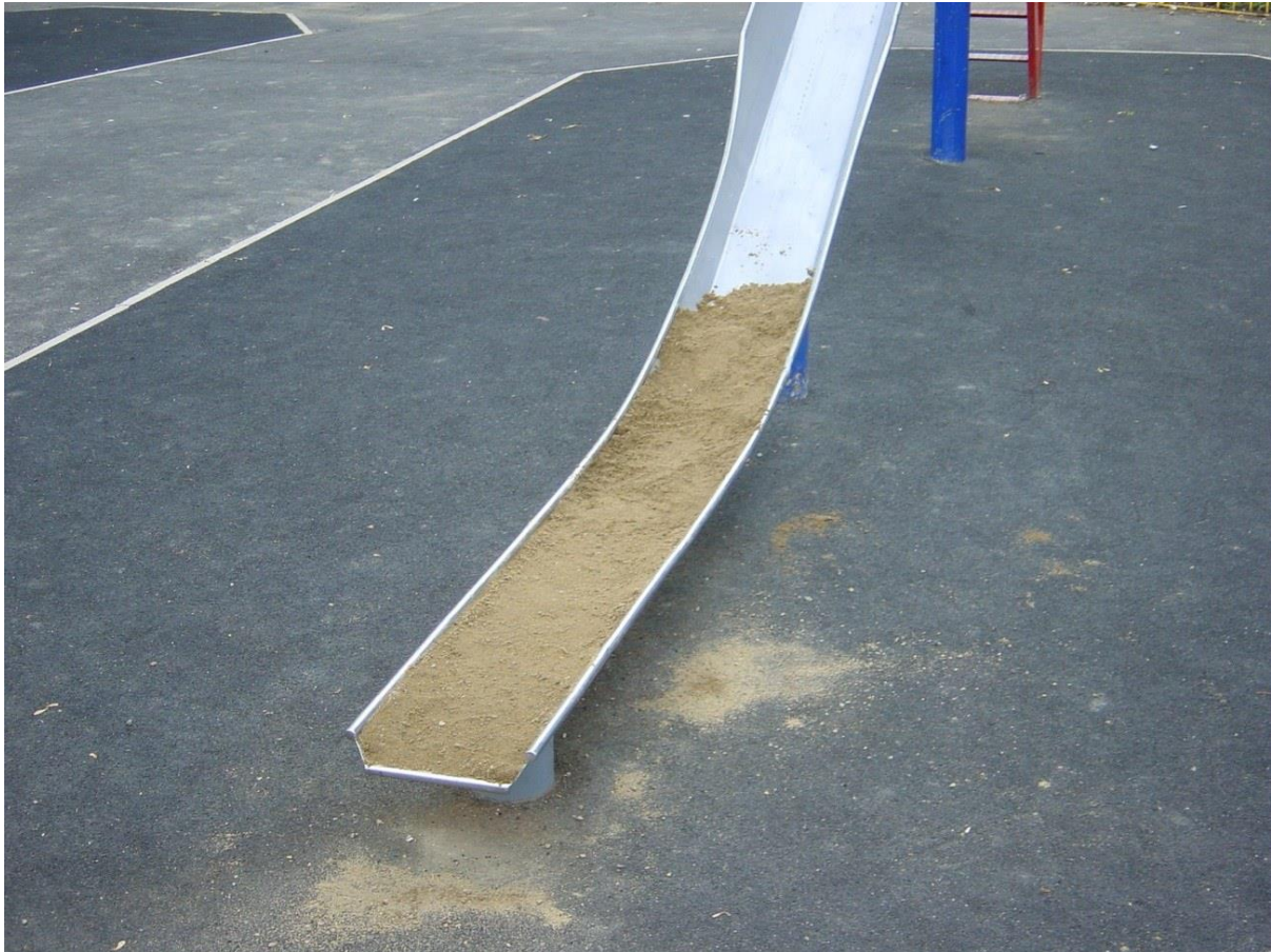
Figure 1: Slide in a public playground in Tower Hamlets, London, UK.

Yet anyone who has watched children at play will know that once they have used the slide in this way and have a feel for it, they will often then explore its potential beyond just sliding. Coming down in different positions, maybe, or climbing up the chute, coming down on roller blades, sending different objects down the slide, sitting on the end chatting, or building a den underneath. Not limited as much as adults to predetermined ideas of what constitutes a slide, children seek to actualise whatever the space affords at that time. 2 From an adult perspective, because the purpose of a slide is to be slid down, these alternative uses could constitute 'not using equipment properly'. It may be that calling a slide a slide closes down possibilities for it being something other than a slide.