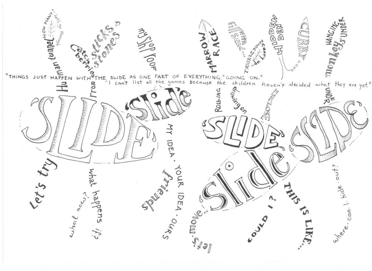
Figure 3: Rhizomatic thinking – starting from the middle © Katherine Masiulonis and Wendy Russell

that children play anywhere, with anything and everything, sometimes to the annoyance of adults, often in ways that adults may not even notice. Play is not only a separate time and space bound activity, it is also a disposition to the world (playfulness) that can arise whenever conditions allow. 6 Designated spaces offer the potential for encounters children may not easily be able to experience elsewhere, or space and time to be relatively free from constraints and demands of their everyday lives, and this is highly significant; but they are not the sum total of children’s play experiences. Sometimes, because we have developed a habit of thinking in particular ways about the concepts of ‘play’ (as a thing) and ‘playspace’ (and all that entails), we conflate play and play provision; yet ‘play is not a public service, much less a commodity’. 7 (p 19)