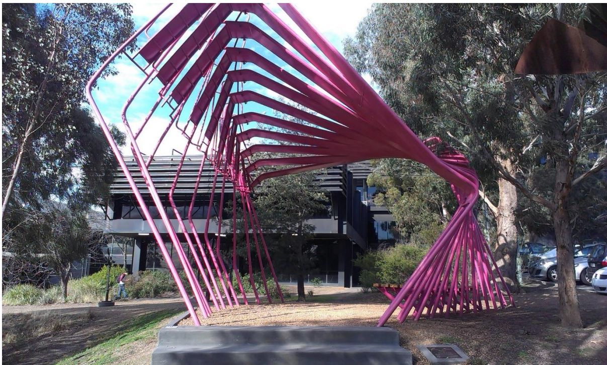
Figure 4: When is a slide not a slide? Reappropriation of slides by Bellemo and Cat at Wombat Bend, Yarra Valley Parklands, Manningham, Victoria, Australia.

The paradox is that if playing represents a line of flight from adult organisation of time and space, then an adult designed and organised playspace becomes a plane of organisation from which children will at times seek lines of flight. We cannot design and plan lines of flight. However, design is not fixed only in a plane of organisation.