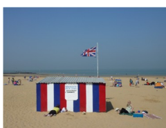
Margate's golden sands

This project explores front line practitioners' perceptions of challenges and opportunities for housing, social care and wellbeing needs of families living in poor privately rented housing in Margate.