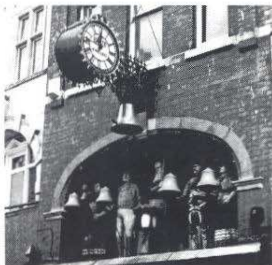
Niehus Brothers clock

Whether the clock was ever constructed is not known, but close by on the junction of Southgate Street and Eastgate Street, the Saxon church of St. Michael incorporated a clock from at least 1546. Records for that year reveal that the sum of eight shillings was paid as the annual remuneration for its maintenance. 12 Furthermore, it was in St.