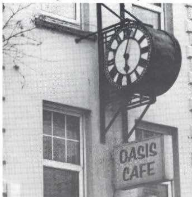
The clock over Oasis Café at No. 59 Southgate Street

located. According to Dowler, one Edmund Simpson occupied No.122 Southgate Street from 1867 until 1885. 54 Using Done's plan, it was quickly established that this site is now No.59, occupied by the Oasis Café. It was noted with interest that on the front face of the building at first floor height, a somewhat dilapidated double