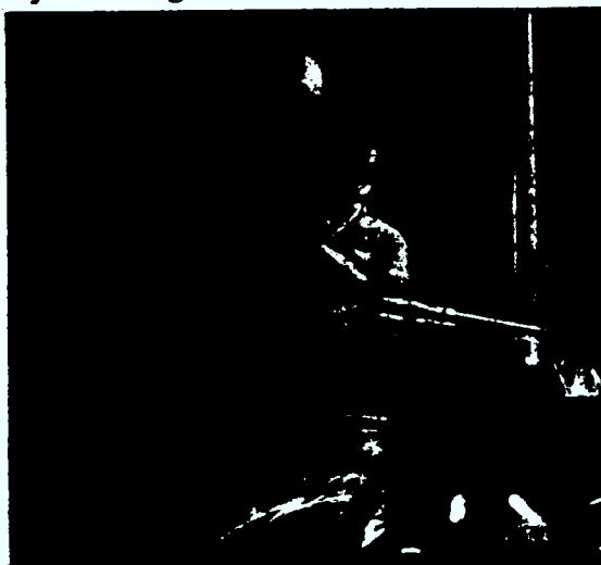
Youth training: some colleges have ignored the scheme

Sixty-eight colleges have a department or unit that has particular responsibility for YTS work. Thirty-one of these are adult, community or general