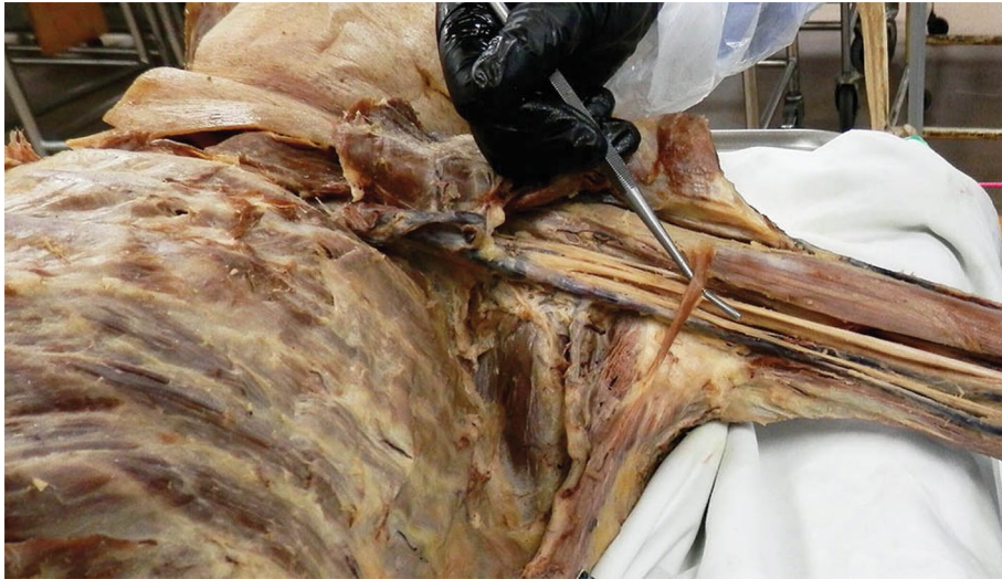
Figure 1. The axillary arch, inferior view. Pectoralis major and minor have been reflected. Probe indicates axillary arch.