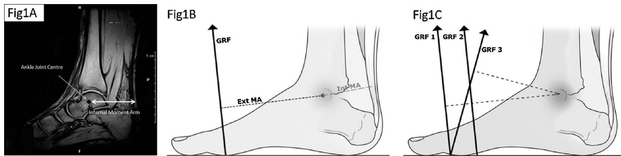
Fig. 1. Definition of internal and external moment arms and illustration of key concepts. A. An example sagittal plane MRI scan of the lower limb showing the measurement of the internal moment arm length (indicated by the white arrow). B. Diagram showing the external moment arm length (Ext MA; black dashed line) as the perpendicular distance between the resultant GRF vector and the joint centre of rotation (●); the internal Achilles tendon moment arm (Int MA; red dashed line) as the perpendicular distance between the tendon's action line and the ankle joint centre (●). The EMA is calculated as: IntMA/ExtMA . C. Illustrative example of how the GRF can be applied on the foot in two different ways causing a reduction in the ExtMA (dashed lines), thereby increasing the EMA and reducing the ankle joint moment and the muscular force contribution from the plantarflexors: i) with the point of application closer to the ankle joint centre (GRF 2 compared to GRF 1) and/or ii) by an altered angle of application (GRF 3 compared to GRF 1).

result in applying force to the ground more distal on the foot, thereby decreasing the EMA due to the increased ExtMA around the ankle. One consequence of this leverage alteration is that the plantarflexion muscles would need to produce more active force to generate the ankle moment required for propulsion. The EMA around the ankle in diabetes patients could also be affected by altered use of the lower limb and foot caused by sensory deficits and plantarflexor muscle weakness. A relative increase in the contribution from ankle plantarflexor muscles during walking may contribute to the increased CoW in diabetes patients.