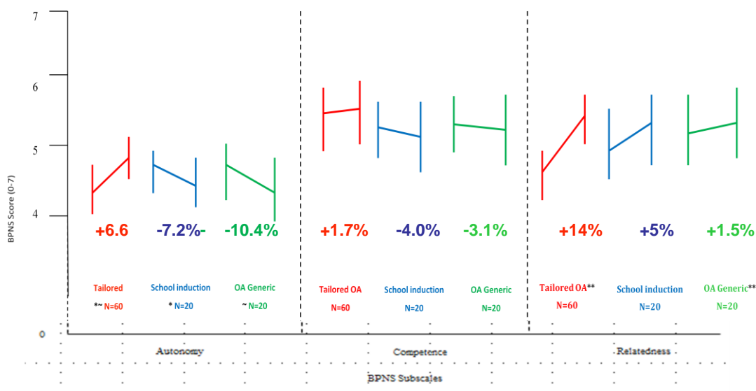
FIGURE 2 : Baseline and follow-up mean difference scores on Basic Needs Satisfaction in Life Scale (BPNS) for Autonomy, Competence and Relatedness by programme

BPNS 0-7 (low-high) standardised scale for each subscale mean score