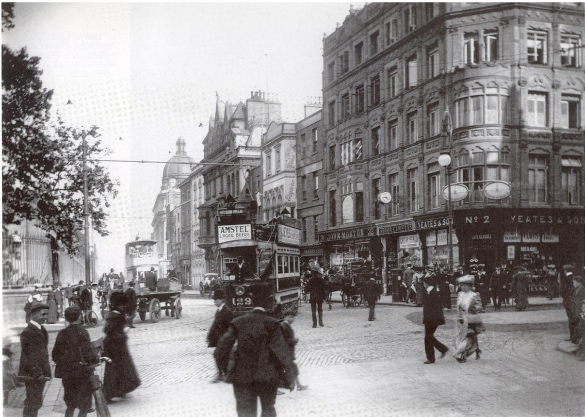
Fig. 1. Yeates & Son, Grafton Street, around the turn of the century, © National Library of Ireland; rpt. in David Pierce, James Joyce's Ireland (New Haven; London: Yale UP, 1992) 52.

In the 'Lestrygonians' chapter, Joyce takes a page to describe Bloom's reflections in a shop window: "He crossed at Nassau street corner and stood before the window of Yeates and Son, pricing the field glasses" (8.551-2). A photograph that has survived of Yeates & Son from around the turn of the century makes Joyce's recollection of the shop, and the extended notice of it that he gives to Bloom, quite understandable (see fig. 1). The large windows are stocked with goods, and lined with posters to advertise them. The shop's sign, on adjacent sides of the corner, spells its name in large letters against a black background. The name of the shop is again displayed on the door, beneath a small image of a pair of glasses. And fixed above the door, on the corner of Grafton Street, is a huge model of a pair of glasses, apparently some ten to fifteen feet across.