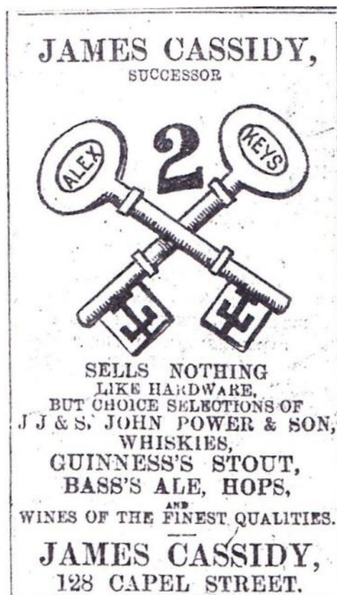
Fig. 3. Advertisement for James Cassidy, possible original for the “HOUSE OF KEY(E)S” advertisement (7.141), Evening Telegraph 14 Mar. 1896: 1.

out of their copy of the Kilkenny People .” 105 There is no way of Bloom copying the original advertisement except by sketch or trace, and while Budgen refers to Bloom having “copied the drawing of the crossed keys,” 106 it would be surprising for an advertisement to use an amateur sketch. Images were still not general in Irish daily newspaper advertisements in 1904: the historical Evening Telegraph for 16 June 1904, for instance, has only eight images across some fifty-four advertisements. As crude as these images may look to us today, however, they were not amateur. Even the historical analogue to the Keyes advertisement, printed nearly a decade before Bloom’s fictional involvement, demonstrates some artistic ability. John Wyse Jackson and Peter Costello have located what seems to be the original of the Keyes advertisement in the Evening Telegraph for 21 March 1896. 107 I have found that the advertisement ran with the same design for several weeks, between 14 March and 4 April; the image in this advertisement is large and relatively detailed, and appears to have been designed by somebody with some idea of shading and dimension (see fig. 3).