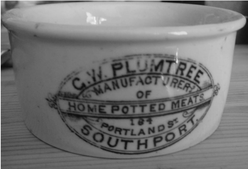
Fig. 6. Plumtree's Potted Meat, manufactured in Southport, England, © Matthew Hayward.

Southport (see fig. 6), and although a number of these pots survive, the disjunction between its actual and its fictional places of manufacture has not been remarked in critical discussions. 50