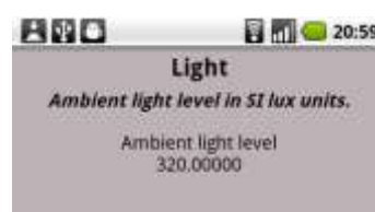
Figure 5 Light sensor in action 2

Figure 4 and figure 5 shows a sub screen of the implementation of the light sensor. The figures show how the background can change according to the measured lux value, also displayed in these screenshots for information purposes. From user testing the implementation of the light sensor as a context-aware dimension variable for user context computation where very welcomed. The ease of use of the application under very different lighting conditions due to the background color adaptation where highlighted as the major positive factor. As figure 6 illustrates we are currently looking into making even more sensor data available and include them into the context-aware equation.