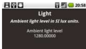
Figure 4 Light sensor in action 1

In our application we have, as previously described, input from five different sensor sources: accelerometer, magnetic field, orientation, proximity and light. This makes for another novel dimension to use in our user context computation. We actively use sensor input for other tailoring of the application as well. Figure 4 and figure 5 displays an example of the light sensors in action. By integrating with the different sensors, such as light, we are able two automatically adjust brightness of the display for the end user. By continuously measuring the amount of light around the devices we are capable of changing the background color based on the value received from the sensor. This shows in the application as a darker background color in the application the brighter the room is. This adaptation is especially useful for the user when using the application in outdoor scenarios because of the improved readability of the user interface.