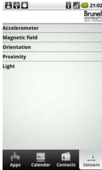
Figure 6 Sensor panel