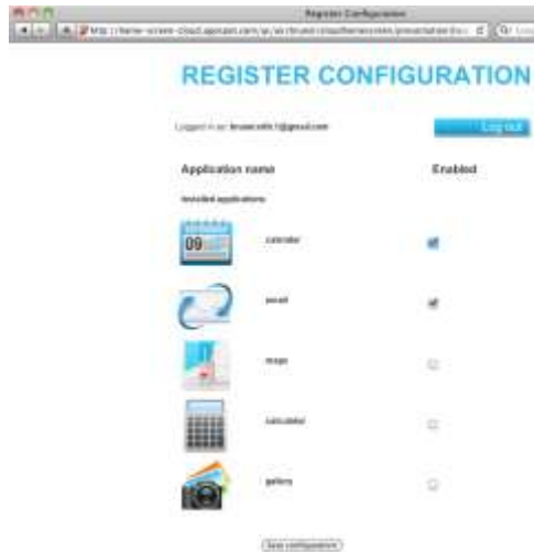
Figure 1 Server overview

The phone will update the home screen when the push message is received from the Android Cloud to Device Messaging system. By configuring these options on the cloud we get several benefits. The configuration values are not tied to one specific device, so there is no need to manually configure each device. By registering the device in the cloud application, any predefined configuration values are pushed to the phone. It is also easier to add more advanced configuration options when the user can take advantage of a bigger screen, mouse and keyboard than those found on small or mobile devices.