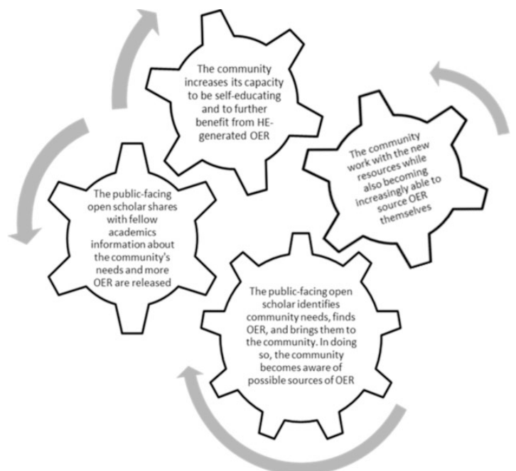
Figure 2: Visualising the collaboration between the public-facing open scholar and online communities outside HE

However, a challenge to the beneficial impact of this new type of academic may be posed in terms of the time required to perform the role and possible clashes with the demands of paid work for the employing uni-