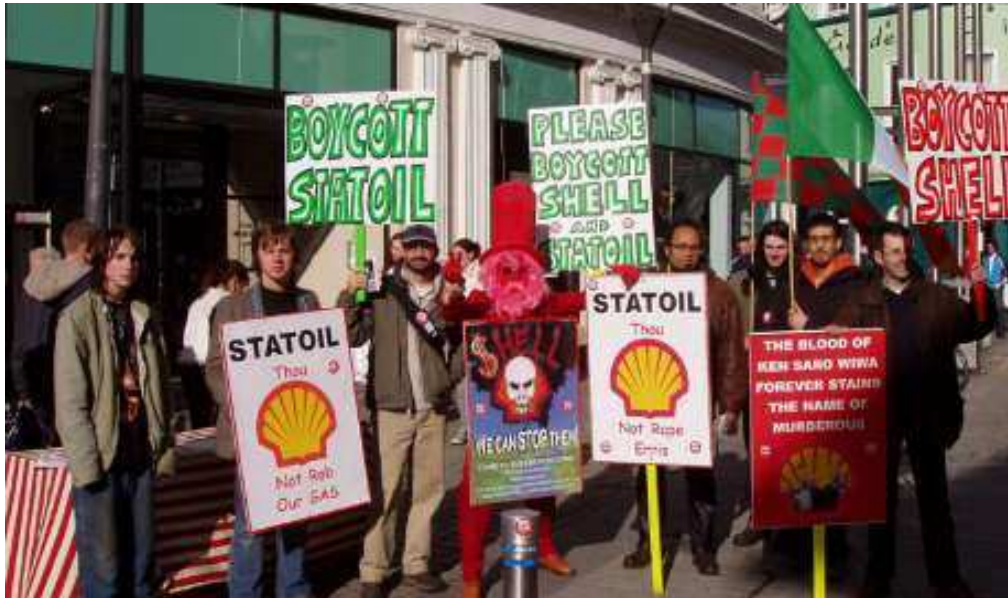
Figure 4. 'Bringing the pipeline back to Statoil' protest. This protest took place on Friday 7 April 2006 by a group of protestors outside Statoil's Dublin office. The pipe was used to blockade the entrance to Statoil's office, to emphasise their opposition to Statoil's involvement in the extraction and processing of the Corrib gas field and to raise public awareness of the campaign.