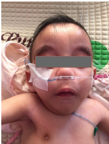
Figure 1: Figure shows clinical appearance of CNPAS such as small chin, widened forehead, low set ears