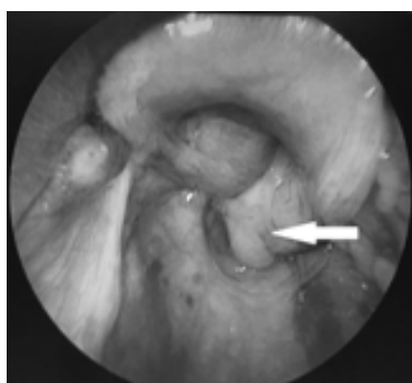
Figure 2: The figure shows a direct laryngoscopy view depicting distorted laryngeal structures with right arytenoid anteriorly displaced (white arrow)

incision around the lesion. Direct laryngoscopy revealed massive suprastomal granulation. At the end of the procedure, a new cuff TT tube was inserted that managed to bypass the distal granulation tissue.