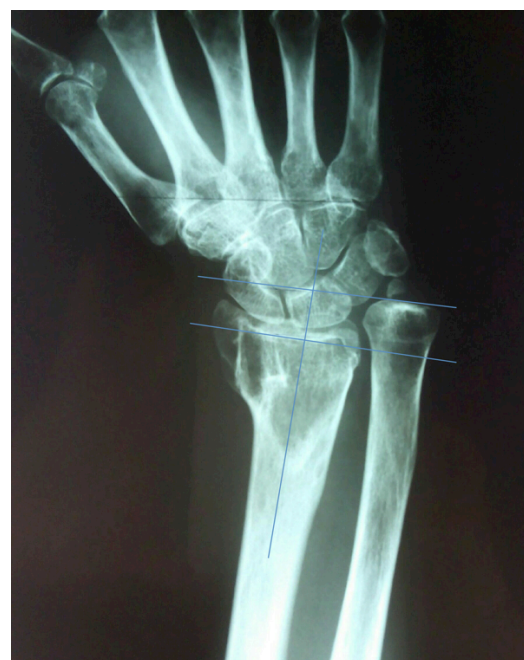
Fig. (1). Radio-ulnar variance measurement.

Distal radius fracture is one of the most common fractures accounting for around 25% of fractures in the pediatric population and up to 18% of all fractures in the elderly age [1]. Malunion of distal radius fracture often results in radial shortening as the main deformity, with disturbed radio-ulnar variance, quite often associated with lesions of triangular fibrocartilage complex (TFCC) and instability of the distal radioulnar joint (DRUJ). Radio-ulnar variance is defined as the difference in length between the distal ulnar corner of the radius and the most distal aspect of the dome of the ulnar head. Positive ulnar variance means that the dome of the distal ulna is more distal than the ulnar corner of the distal radius [2] (Fig. 1). This positive variance may lead to ulnar sided wrist pain, limited ulnar deviation and forearm rotation with development of degenerative changes due to the overloading that occurs between the ulnar head and the ulnar carpus. Impaction of the ulnar head