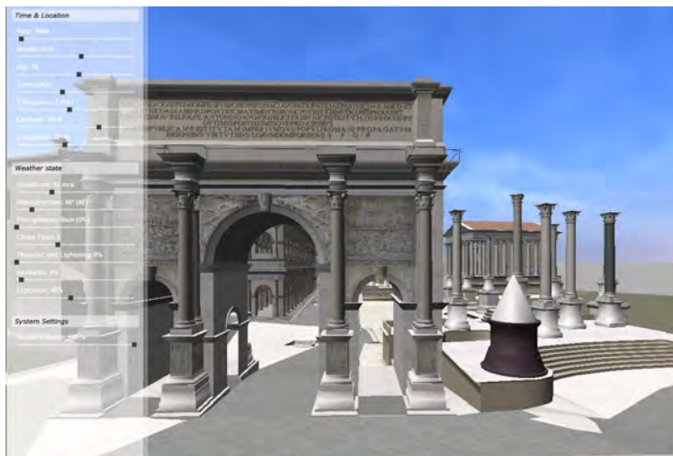
Fig. 1 ‘Roma Nova’ - Experiencing ‘Rome Reborn’ as a game.

The popularity of video games, especially among younger people, makes them an ideal medium for educational purposes [116]. As a result there has been a trend towards the development of more complex, serious games, which are informed by both pedagogical and game-like, fun elements. The term ‘serious games’ describes a relatively new concept, computer games that are not limited to the aim of providing entertainment, that allow for collaborative use of 3D spaces that are used for learning and educational purposes in a number of application domains. Typical examples are game engines and online virtual environments that have been used to design and implement games for non-leisure purposes, e.g. in military and health training [114,204], as well as cultural heritage (Figure 1).