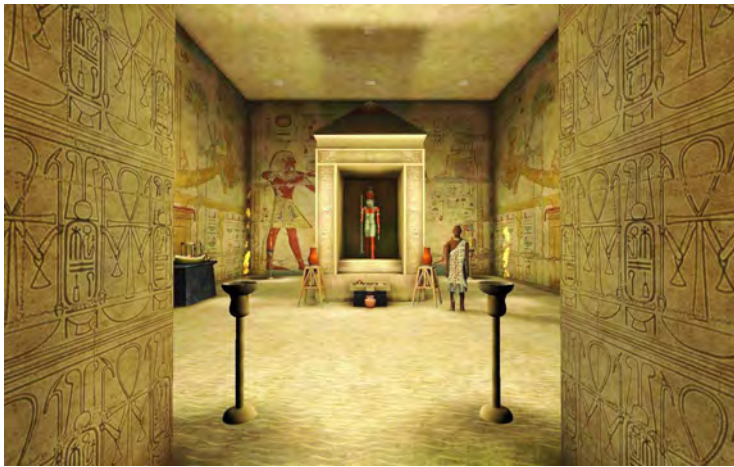
Fig. 3 New Kingdom Egyptian Temple game.

The objective of the game ‘Gates of Horus’ [82] is to explore the model and gather enough information to answer the questions asked by the priest (pedagogical agent). The game engine that this system is based on is the Unreal Engine 2 (Figure 3) [84], existing both as an Unreal Tournament 2004 game modification [194] for use at home, as well as in the form of a Cave Automatic Virtual Environment (CAVE [35]) system in a real museum.