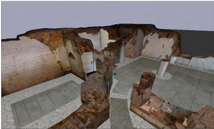
Fig. 5 Priory Undercroft – a Serious Game

Furthermore, a first version of a serious game (Figure 5) has been developed at Coventry University, using the Object-Oriented Graphics Rendering Engine (OGRE) [198]. The motivation is to raise the interest of children in the museum, as well as cultural heritage in general. The aim of the game is to solve a puzzle by collecting medieval objects that used to be located in and around the Priory Undercroft. Each time a new object is found, the user is prompted to answer a question related to the history of the site. A typical user-interaction might take the form of: "What did St. George slay? – Hint: It is a mythical creature. – Answer: The Dragon", meaning that the user then has to find the Dragon.