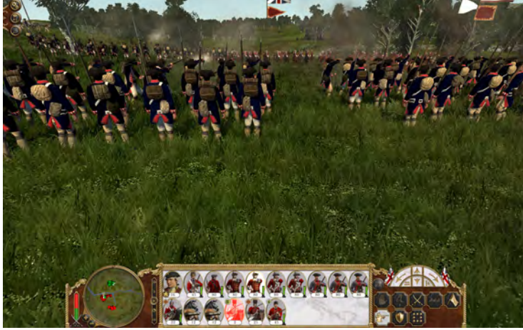
Fig. 7 Reliving the battle of Brandywine Creek [124] in ‘Empire: Total War’.

realistic depiction of history. As a result, games from the Total War series have been used to great effect in the visualisation of armed conflicts in historical programmes produced for TV [196].