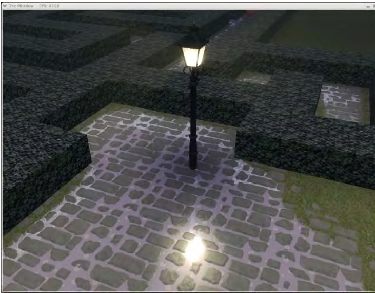
Fig. 8 Achieving a mirror effect by rendering the geometry twice [5].

The modern real-time graphics pipeline does not deal with the visual representation of transparency, reflection or refraction and their emulation must be dealt with using special cases or tricks. Traditionally, transparency has been emulated using alpha blending [1], a compositing technique where a ‘transparent pixel’ is combined with the framebuffer according to its fourth colour component (alpha). The primary difficulty with this technique is that the results are order dependent, which requires the scene geometry to be sorted by depth before it is drawn and transparency can also present issues when using deferred shading [58]. A number of order-independent transparency techniques have been developed, however, such as depth-peeling [53, 132].