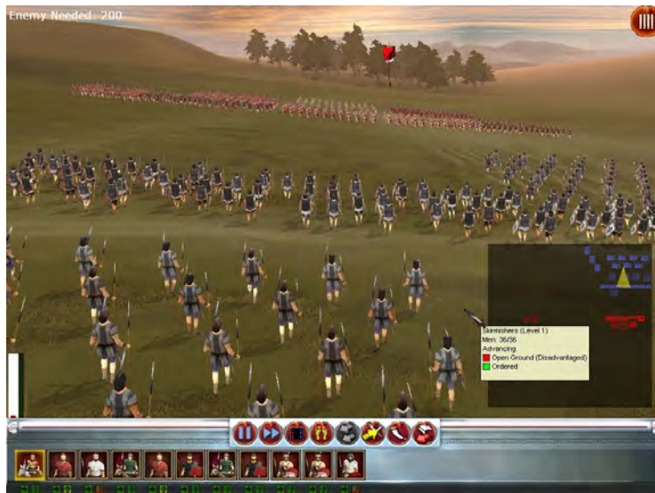
Fig. 6 Great Battles of Rome.

The game's historical context was introduced in a long (animated) introduction, depicting the geo-political situation of the period and the events leading up to the outbreak of war in 1914. In between battles the player is provided with additional information on concurrent events that shaped the course of the conflict, which is illustrated with animations and newspaper clippings from the period.