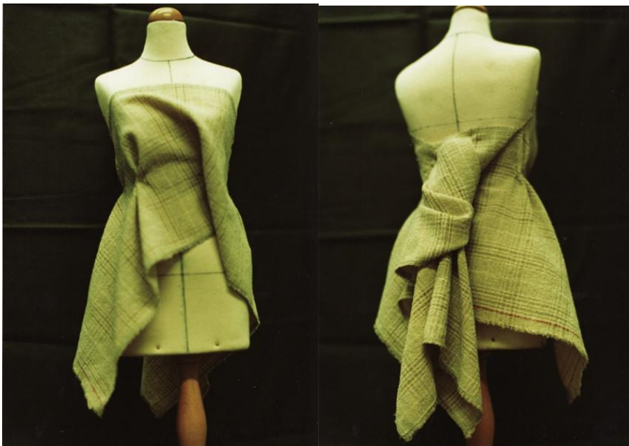
Figure 3: Sample of a SCT toile – experiment with one split