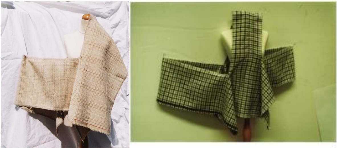
Figure 2: SCT cloths with one split (left) and two splits (right)

The Researcher then experimented with SCT in half- and full-scale and developed toiles see Figures 2-4 below as well as finished, wearable garments.