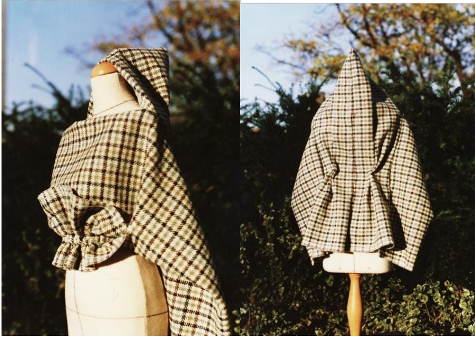
Figure 4: Sample of a SCT toile – experiment with two splits