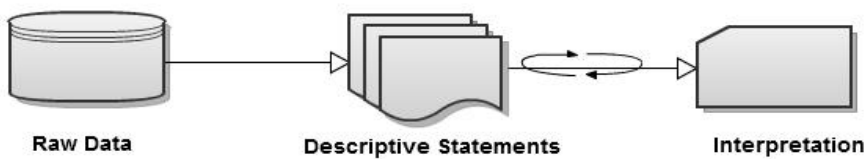
Figure 1: Krueger's (1994) data analysis model for focus groups

architectural practice is a regional leader in BIM adoption which is practicing BIM from last five years. The general contractor is a large, national size company and very actively involved in the developing and implementing BIM standards in the UK. The manufacturing company is a huge size multi industry product manufacturer who are developing their BIM product libraries. Each focus group was a 90 minute interactive session with the aim to investigate the problems in current collaboration systems and industry requirements for BIM collaboration platforms. Data collected was in the form of post-it notes, hand notes and recording of conversations. All the data was recorded and processed anonymously using the methodology described in Krueger (1994). The data analysis process is shown in figure 1