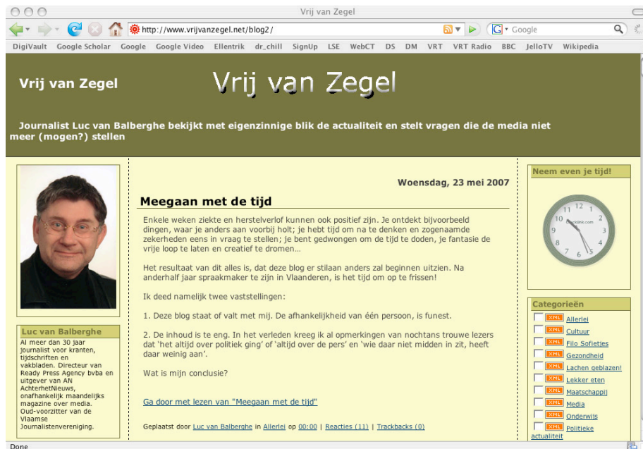
Figure 3: Screen-Shot of the blog 'Vrij Van Zegel'