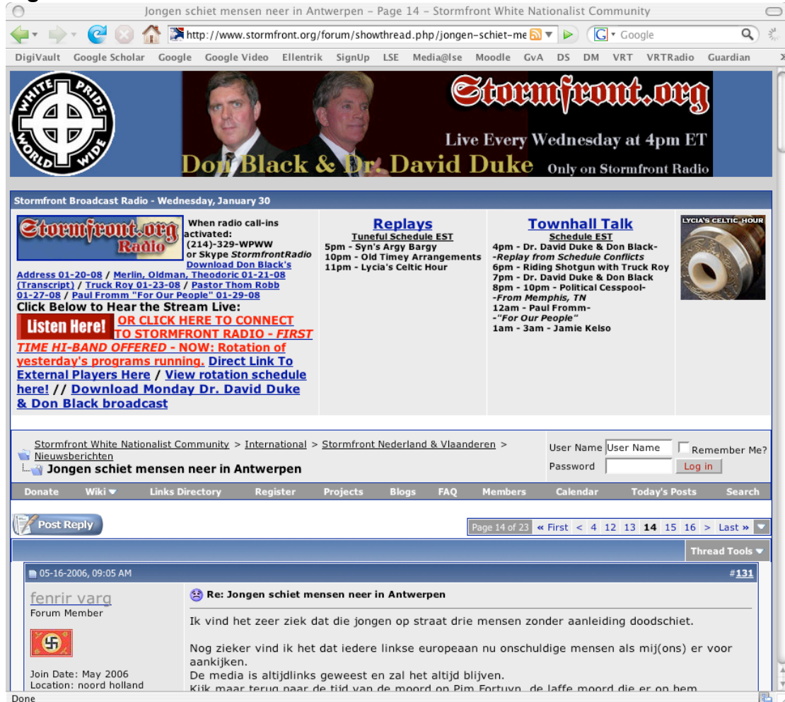
Figure 2: Screen-Shot of the online forum 'Stormfront' – Dutch version