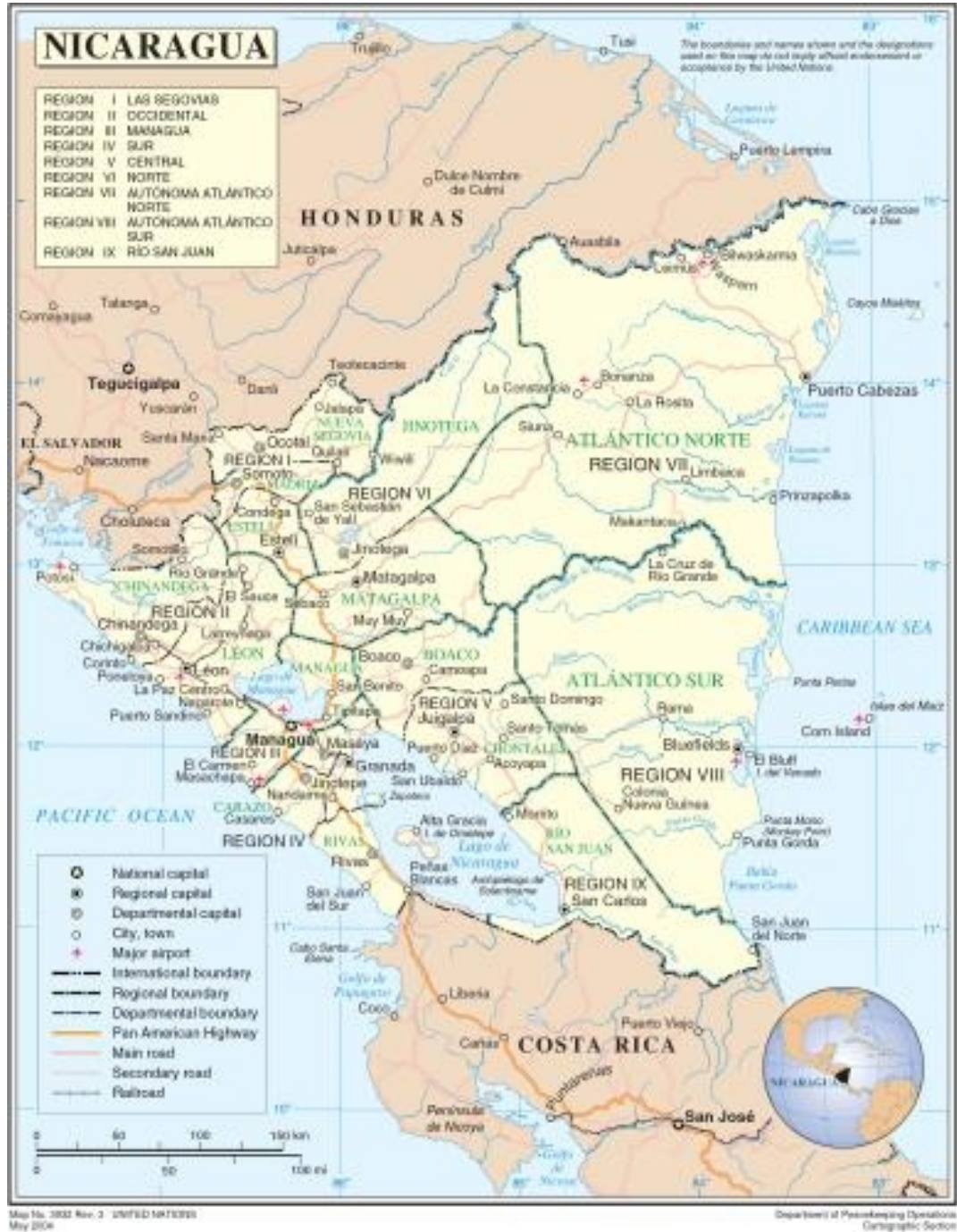
Figure 1: Map of Nicaragua 1