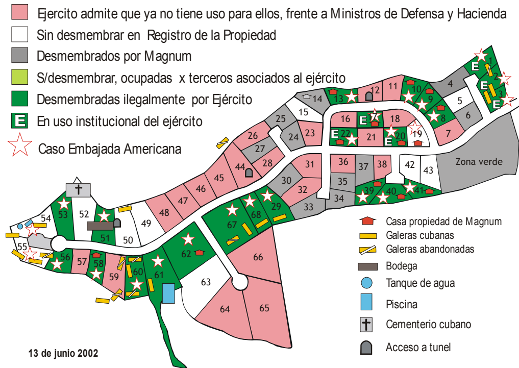
Figure 3: Map of Las Serranías 462