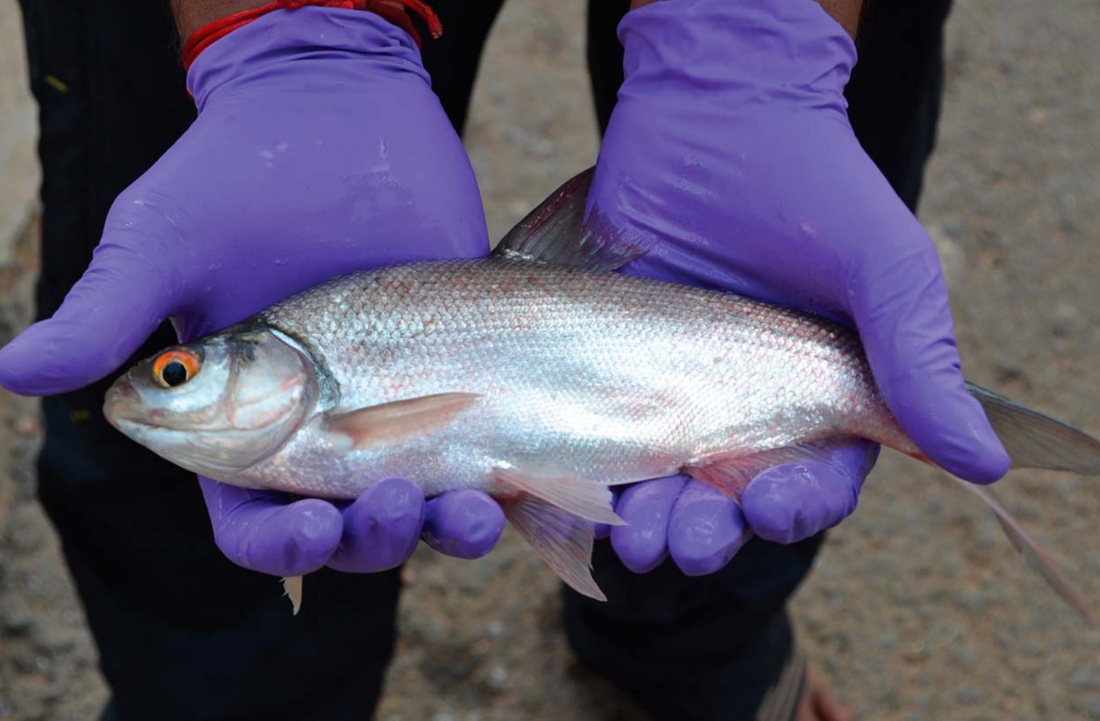
Pengba (Osteobrama belangeri) , state fish of Manipur.