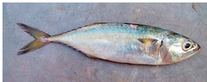
Indian Mackerel (Rastrelliger kanagurta), national fish of India.

Over exploitation, habitat destruction, introduction of exotic species and pollution has led to the loss of native germplasm. Biodiversity conservation is very important to preserve species and also to safeguard the local interest and the cultural attachment of people to certain species. Several species from India are already extinct and many are endangered, threatened or listed in different categories based on their natural presence. The estimated current extinction rate is very high, ranging between 1000-10000 times the natural rate 2 . Hence, appropriate strategies for biodiversity conservation management are required.