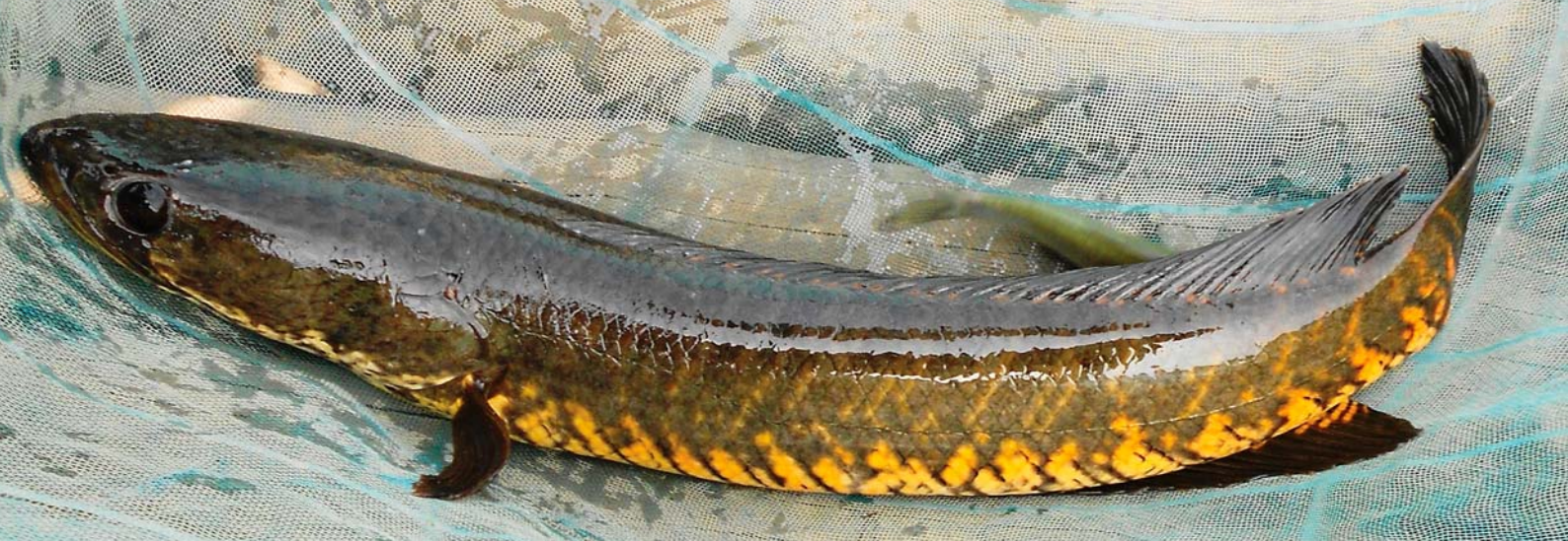
Murrel ( Channa striatus ), state fish of Andhra Pradesh.

Fish is a very good source of nutrition and has to be preserved for the sake of food security as well. Fisheries has provided food and livelihood to millions of people and in several places livelihoods of local communities are dependent on a particular species, frequently leading to over exploitation. To balance livelihoods and sustainability, it is important to bring awareness among the people to conserve the species. Peacock and the tiger being the national bird and animal respectively, have their own stature in the minds of people and there is always a special interest to preserve these species. Similarly, Indian mackerel is our national fish, found abundantly on the south west coast of India and has a special place in the life of people residing there.