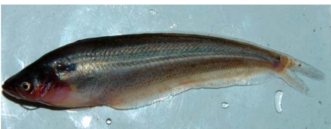
Pabda (Ompak bimaculatus), state fish of Tripura.

Out of the 13 species adopted by 17 states, 2 are endangered and 5 are near threatened and if proper care is not taken, there is every chance of losing these species. The conservation of aquatic organisms has to be taken very seriously as more and more organisms are approaching a threat of extinction. The state fish concept is an innovative step to make people understand and take care of species that are related to the everyday life of the people. It leads to the conservation of the local germplasm and helps to maintain sustainability in fisheries activities. It is the responsibility of every person to contribute to conservation of biodiversity, and not just the states who have declared their state fishes. It is "easy to lose a species but impossible to create one". This concept of encouraging region specific conservation method will bring more awareness in people for biodiversity conservation and sustainable livelihoods.