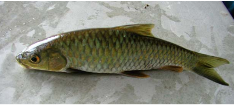
Chocolate Mahaseer (Neolissocheilus hexagonolepis), state fish of Nagaland.

Breeding has been successfully demonstrated and captive breeding of the species is being undertaken in parts of India to provide food fish 15 .