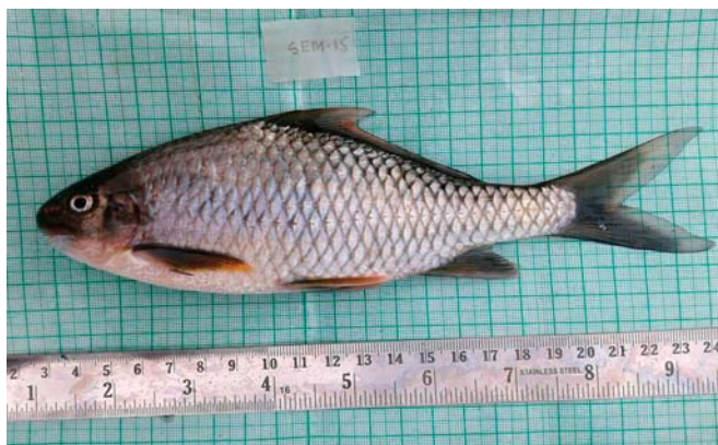
Nghavang (Semiplotus modestus) , state fish of Mizoram.

Indian state of Uttar Pradesh has adopted Chitala chitala (chitala) as its state fish. It belongs to the family Notopteridae. Chitala is mostly restricted to the Indian subcontinent and the stock has declined considerably. However, limited data is available on the population status and it has been difficult to estimate the period over which the suspected decline has occurred. The species congregates, making it very easy to catch where it is present. The catches of this species are fast declining in India. In conservation terms it is assessed as near threatened category according to IUCN guidelines.