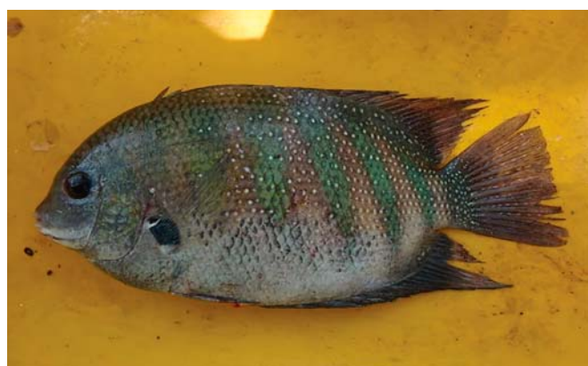
Karimeen (Etroplus suratensis), state fish of Kerala.

Mizoram has adopted Semiplotus modestus (nghavang) as its state fish. It belongs to the family Cyprinidae. This is a very rare species and it inhabits moderate to fast flowing mountain streams and rivers with rocky bed. The hill streams are now threatened by sedimentation due to deforestation and agricultural practices resulting in habitat destruction of the species. Research on distribution, biology, habitat and threats are very necessary. The species is at present assessed as data deficient category according to IUCN guidelines. Further survey work is needed to determine whether or not this species is experiencing a decline, or is undergoing extreme population fluctuations 11 .