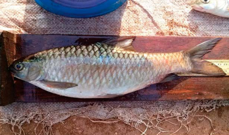
Carnatic Carp (Puntius carnaticus), state fish of Karnataka.

4,000-5,000 eggs/kg body weight. The artificial breeding techniques are standardised but the seed production has to be increased 5 .