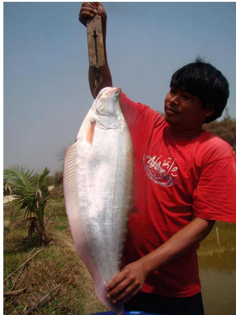
Chitala (Chitala chitala), state fish of Uttar Pradesh.