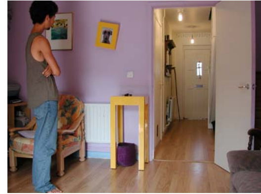
A volunteer observes the picture frame tilting.

We gave the Key Table to a London family to live with for about a month. To our surprise, their understanding of the device centred on the dog - 'Tobie', as they called it – pictured in the frame. To the family, interactions with the table wasn't just a matter of expressing emotions, but also involved playing with Tobie. Though unexpected and not entirely welcome, this result emphasised the potential for design to support a wide range of playful engagements and was one of the reasons for our continuing interest in design for interpretation.