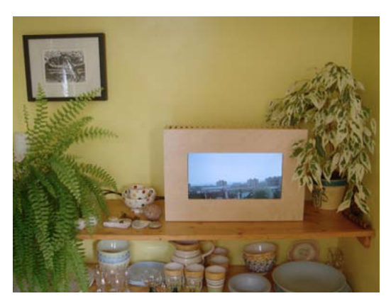
The Video Window display in the home