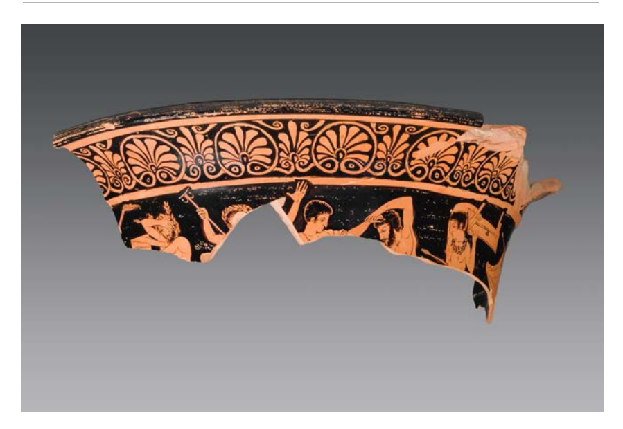
Fig. 1. The killing of the suitors. Apulian calyx-krater fragment, attributed to the Hearst Painter, ca. 400 B.C.E. Basel, Collection of Herbert Cahn. Reproduced by permission.