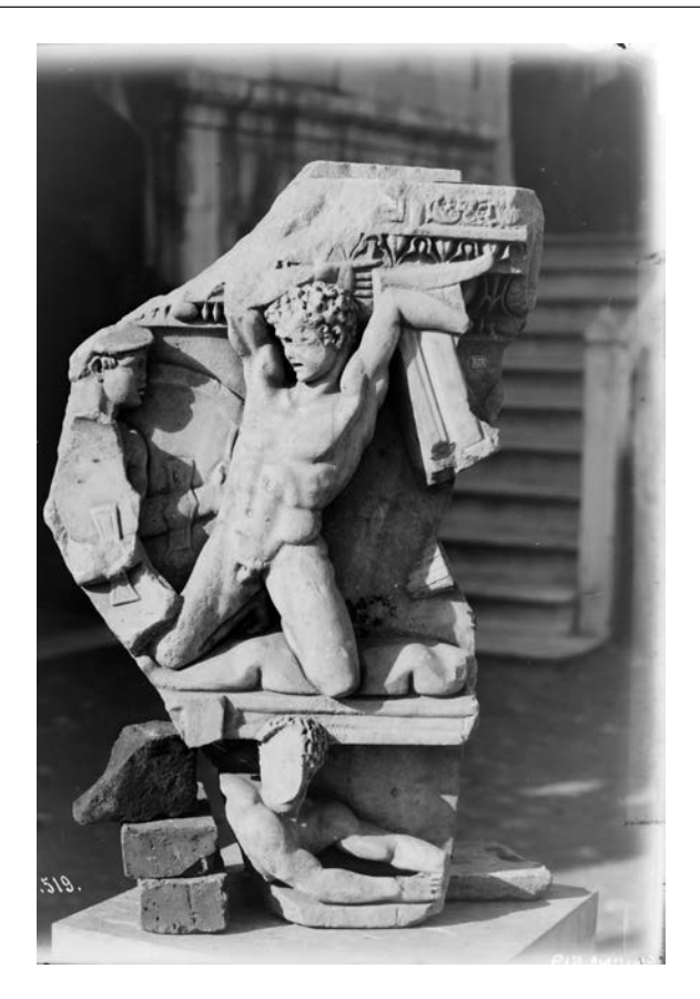
Fig. 4. The killing of the suitors. Attic sarcophagus fragment, ca. 300 c.e. Istanbul, Archaeological Museum. Reproduced by permission.

later on the Heroön from Trysa dated to the beginning of the fourth century B.C.E. Later, two Greek vases, some funerary urns from Etruria and a painting in the Corinthian Peribolus of Apollo attest to the presence of the same theme in the Hellenistic Era.<sup>33</sup> Finally, three or four sarcophagi extend the