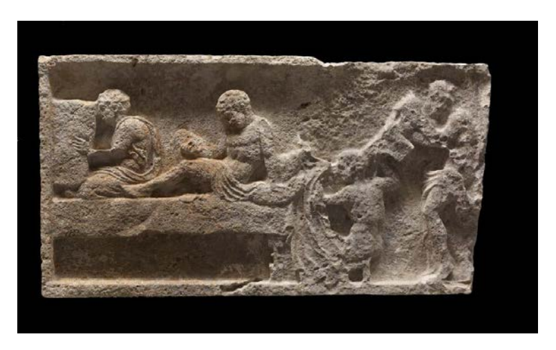
Fig. 2. The killing of the suitors. Relief sculpture, Heroön de Gjölbaschi-Trysa, ca. 400–350 B.C.E. Vienna, Kunsthistorisches Museum–Museumsverband. Reproduced by permission.