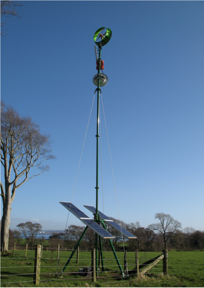
Fig. 2: Prototype “WindFi” base station on the Isle of Bute, Scotland, which has been running since early 2010. The base contains solar panels and batteries, over which a 10 m mast carries the wind turbine with antennas and radio equipment directly beneath.