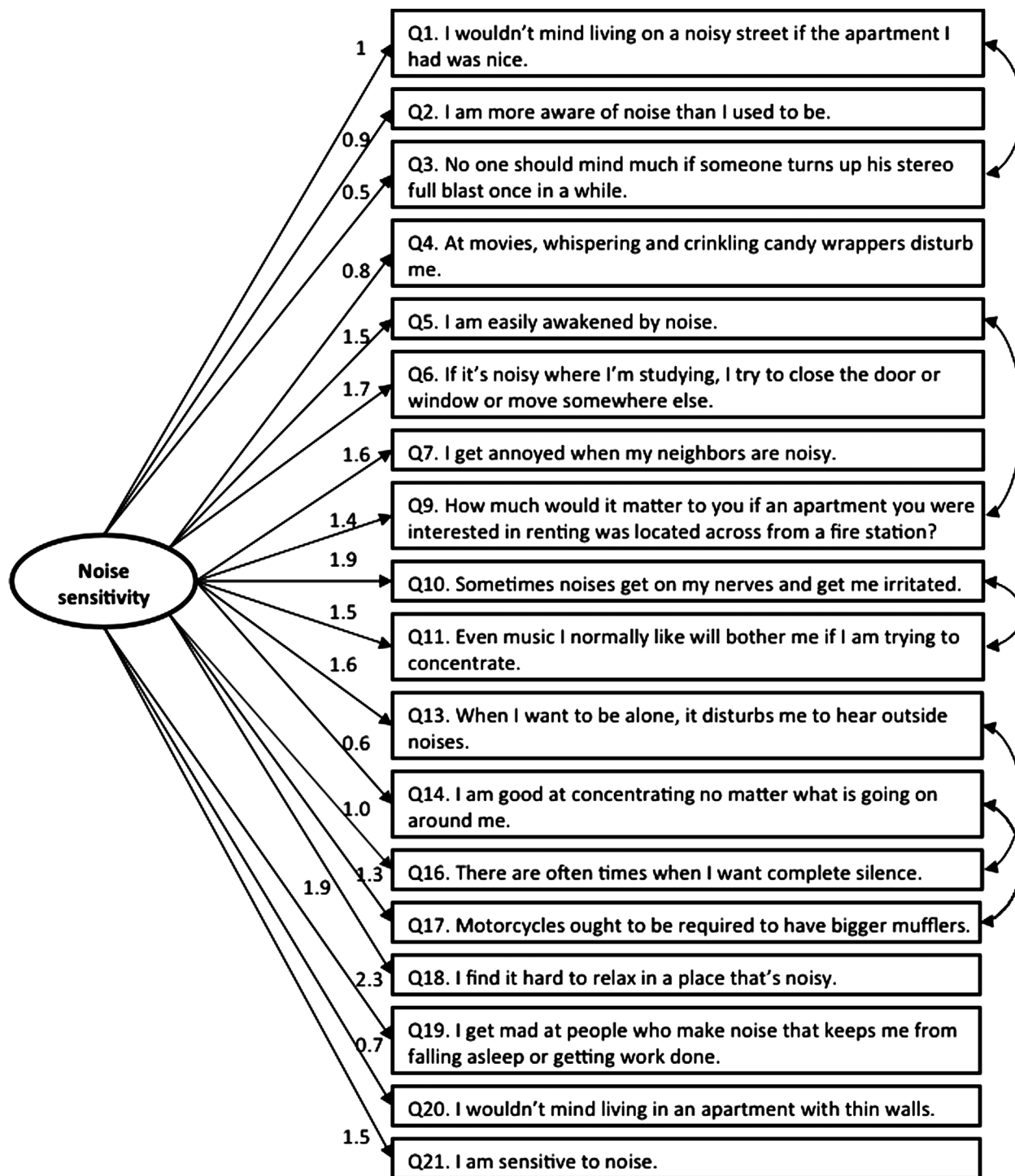
Figure 2: Path diagram with unstandardized coefficients of the 1-factor structure of the 18-item Chinese Weinstein Noise Sensitivity Scale

Although the WNSS was originally developed as a unidimensional tool to assess noise sensitivity, two- and four-factor structures of the WNSS have been previously identified. [2,10] The difference in factor structure can be a result of using a suboptimal method to determine the number of factors or the presence of artifactual factors. Most, if not all, previous studies assessed the scree plot for determining the number of factors, which has been the most common approach to determine the number of factors in an EFA since