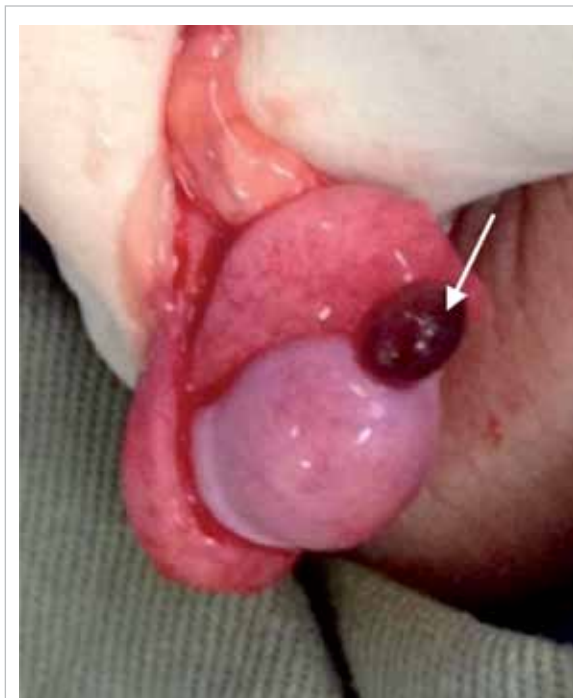
FIG 4. Torsion and testicular appendage Torsion of a testicular appendix (hydatid of Morgagni) is shown (arrow)

Varicocele is an abnormal venous dilatation and/