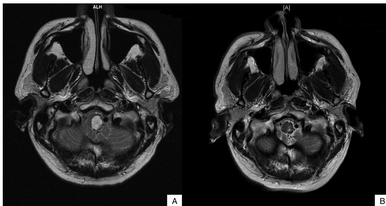
Figure 1. T2-weighted magnetic resonance imaging of the brainstem showing partial response in the medulla oblongata metastasis with alectinib treatment. (a) Medulla oblongata metastasis while on ceritinib for 30 months and after CyberKnife treatment, measuring 10 × 13 × 18 mm. (b) Medulla oblongata metastasis after 6 months of alectinib treatment, which showed interval reduction in size and enhancement, measuring 3 × 5 mm.

Alectinib has been shown to have important clinical activity in brain metastases, including CNS relapse with other ALK inhibitors. In a phase II trial with 84 patients, the CNS disease control rate of alectinib was 83% with a median duration of CNS response at 10 months [3]. Its activity against brain metastases was similar regardless of previous radiation therapy or not. Alectinib also demonstrated improved progression-free survival relative to crizotinib among patients with brain metastases in the J-ALEX study [4]. In a case series, alectinib demonstrated