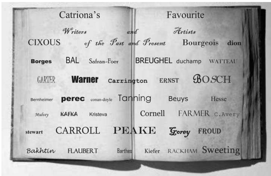
Based on 'Max Ernst's Favorite Poets and Painters of the Past' in View Magazine: Special Max Ernst Edition , Charles Henri Ford ed. Series II, No.1 (April 1942): 14-15.