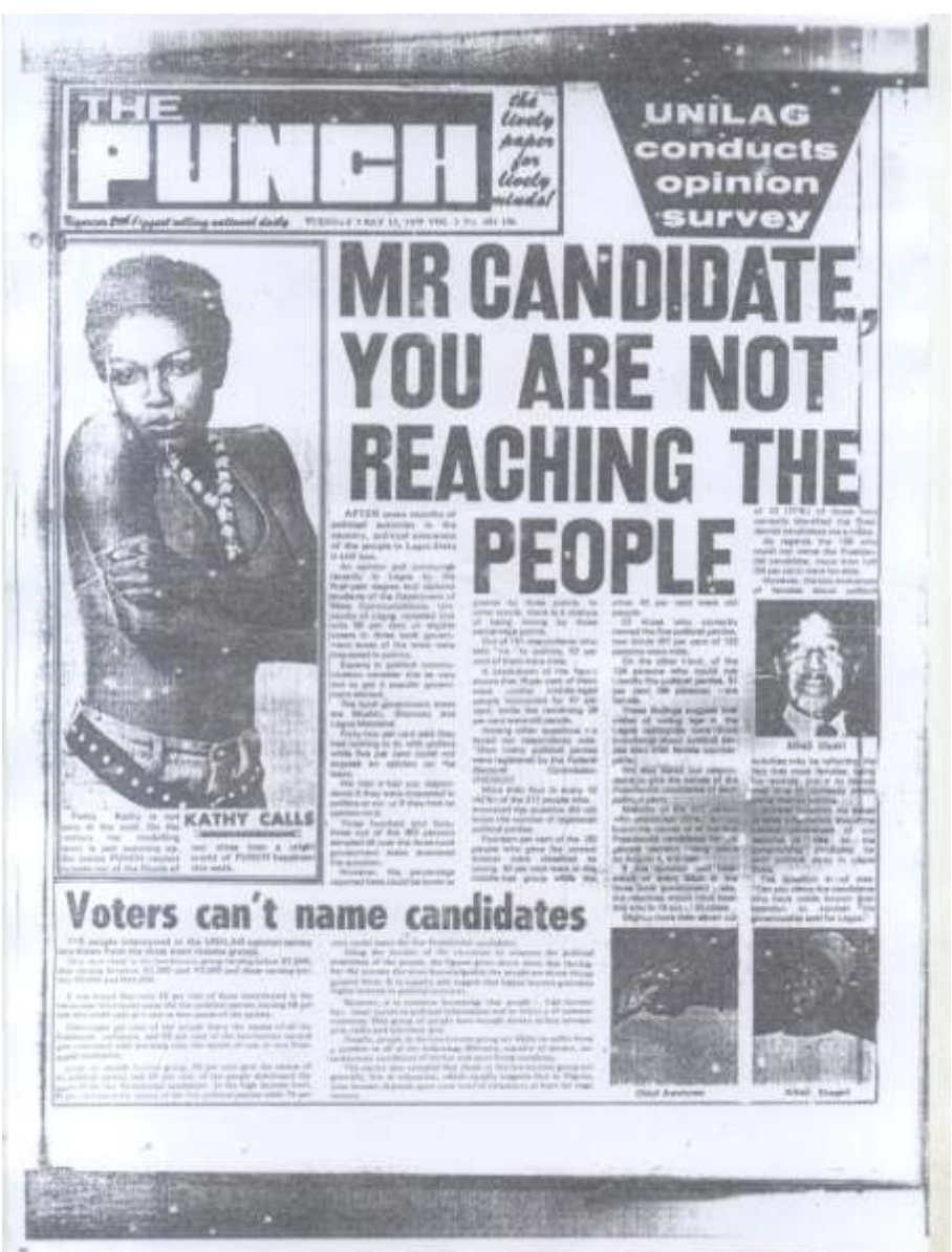
Fig. 3: Level of communication between politicians and electorates