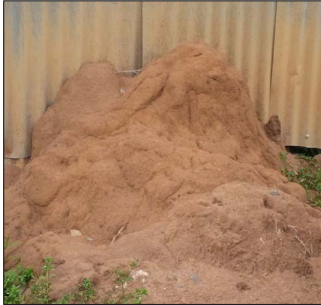
Figure-1. One of the termitaria prior to sampling.

some chemical properties such as: the metallic content, pH, organic carbon (OC), organic matter (OM) etc.