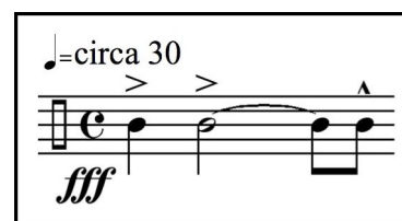
Figure 2. La Rage , excerpt of 1 st movement’s Score (Tremblay 2005)

A convincing example of this is the opening phrase of the piece: three snare drum strokes involving counterpoint from the real-time processing, making a crescendo between the second and third stroke (Figure 2).