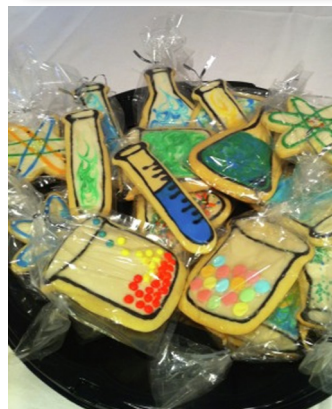
Edible chemistry cookies!