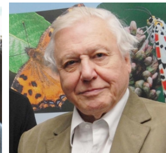
Professor Steve Jones and Sir David Attenborough