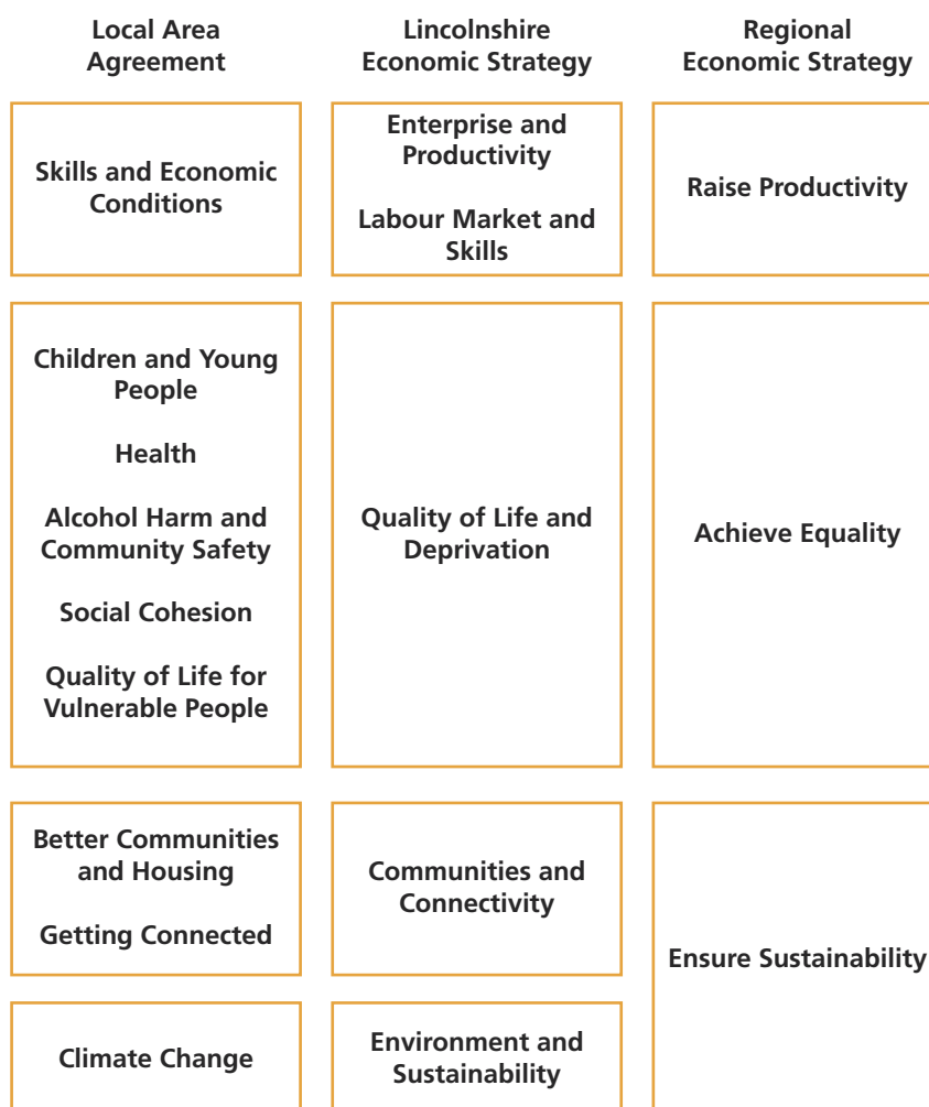
Diagram 1: The LAA, LES and RES Priorities