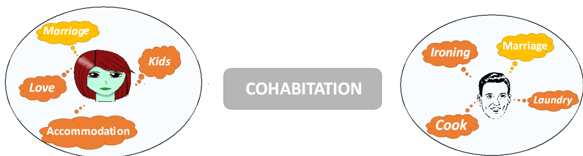
Figure 7.1: Thoughts of men and women in cohabitation

The findings show that male and female cohabiters hold differing expectations of the relationship. For the majority of female cohabiters across all ages, race, ethnicity, and employment status, cohabitation is a transition phase towards marriage (cf. Figure 7.1).