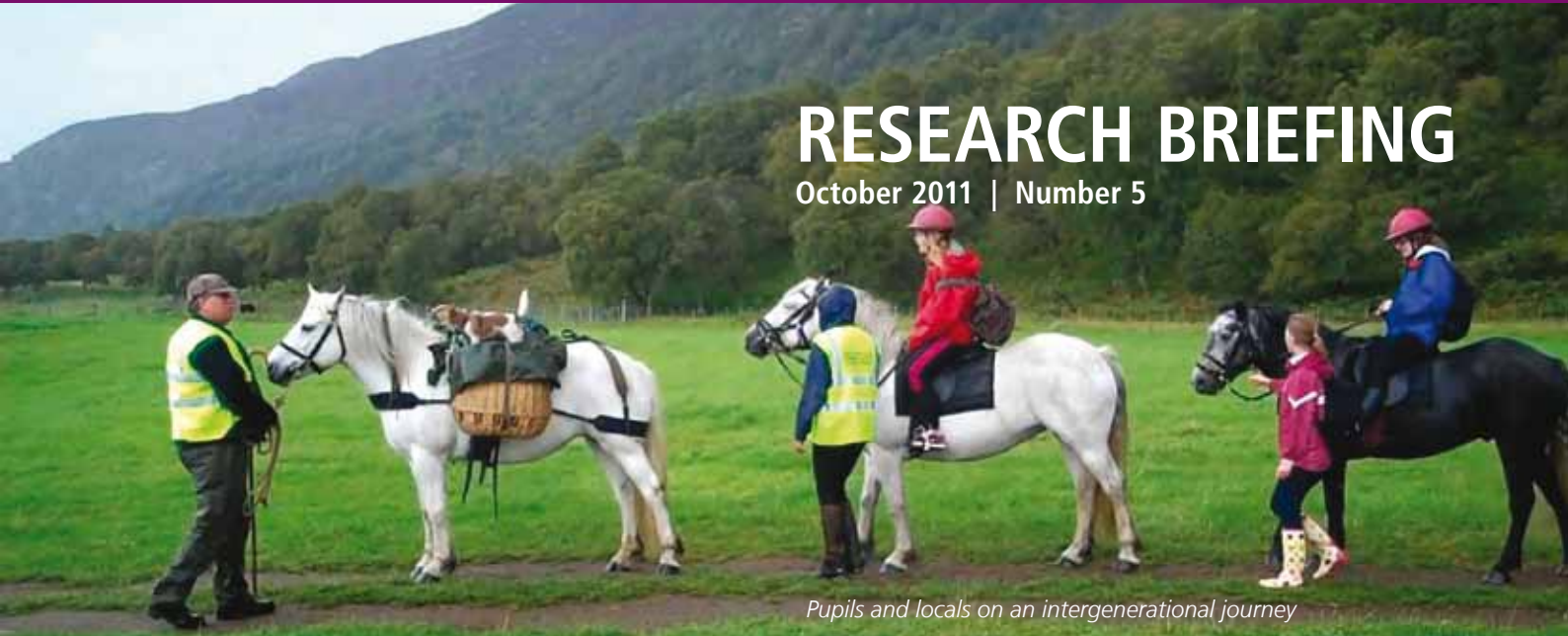
Pupils and locals on an intergenerational journey