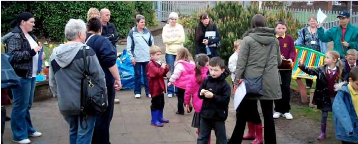
Parents and pupils gather for outdoor learning in the community garden

For more information on research and knowledge exchange at the School of Education, please log on to www.ioe.stir.ac.uk