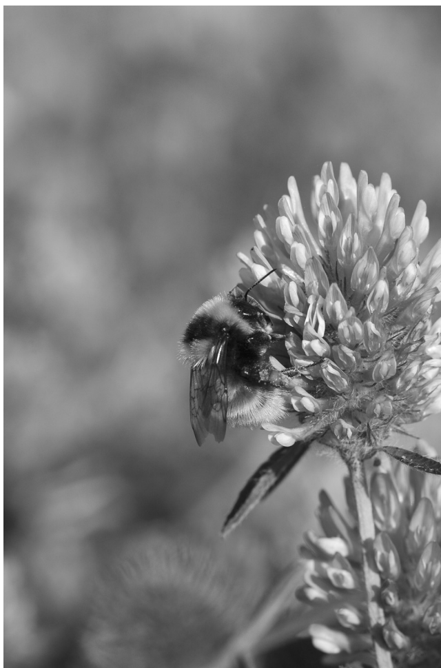
Figure 23.1 A Great Yellow Bumblebee worker collecting pollen from Red Clover on unimproved flower-rich grasslands on South Uist, Outer Hebrides. This is probably Britain's rarest bumblebee, and is now confined to the far north and west of Scotland (see colour plate).

bumblebee species cannot be conserved by managing small protected 'islands' of habitat within a 'sea' of unsuitable, intensively farmed land. Large areas of suitable habitat are needed to support viable populations in the long term. Also, studies of foraging range indicate that bumblebees exploit forage patches at a landscape scale, so that the scale of management must be appropriate. An integrated approach across large areas