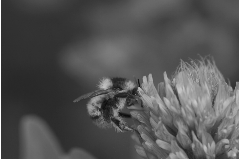
Figure 23.2 A Shrill Carder bee. This species is associated with flower-rich unimproved grasslands in southern Britain, a habitat which has been all but entirely eradicated leading to precipitous declines in several bumblebee species (see colour plate).