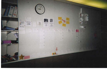
Figure 1. (Agile) A photograph of the Wall, showing story cards arranged in an array that indicates status and priority.

teams employ a rich repertoire of informal external representations, offering differing perspectives on the software. Traditional teams' shared representations – on shared whiteboards and on papers pinned to walls – tend to be concerned with requirements, functionality, conceptual structure, and software architecture, with a certain amount of planning information (usually in the form of lists or annotations) juxtaposed. Whereas the agile 'Wall' is typically a single, focal representation, the shared displays in traditional teams are often more numerous, although there are typically key displays in places of high traffic. There are examples of 6-foot whiteboards propped next to desks or mounted in corridors and near coffee machines. Developers are observed standing around, glancing at them, gesturing toward them.