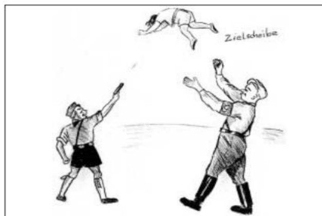
A birthday present for the camp commander's 10 year old son. Jewish babies are thrown into the air, and he shoots them.

Yet, the art selected for the purpose of meeting this objective includes depictions of toddlers thrown into the air and shot by a 10-year old Nazi boy as a birthday present (Figure 1).