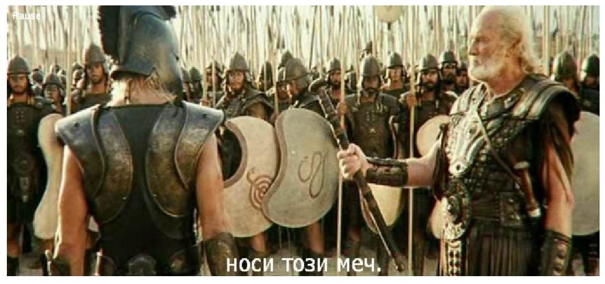
Figure 2 . Screenshot from the film Troy (2004)

Other researchers (Shiptchanov, 2013) have also analysed translator's mistakes. Figure 2 represents one such mistake with realia.