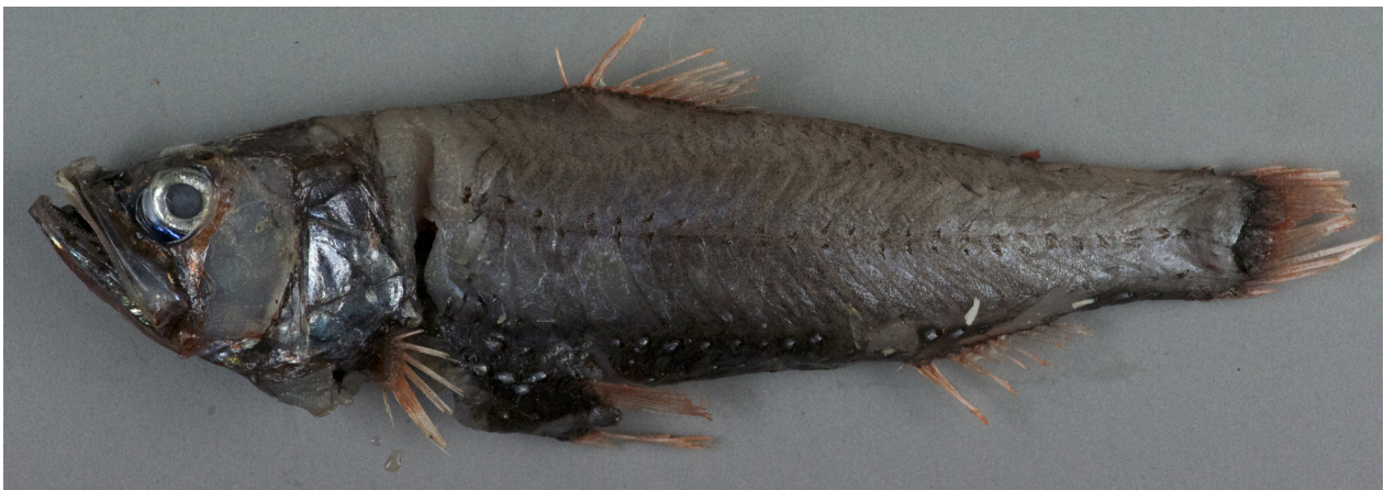
Fig. 2. Specimen of Neoscopelus macrolepidotus from the Porcupine Bank (IEO-ST-PC16/056)

The MOW contribution to the northward distribution of species from lower latitudes has already been suggested before by De Mol et al. (2002, 2005) who hypothesized that the large deep-water coral banks of Lophelia and Madrepora in the Porcupine basin could have been originated by the introduction of larvae transported by the MOW from the Mediterranean to the northeast Atlantic. The same pathway of dissemination has also been suggested for the Polynoidae polychaetes, Harmothoe