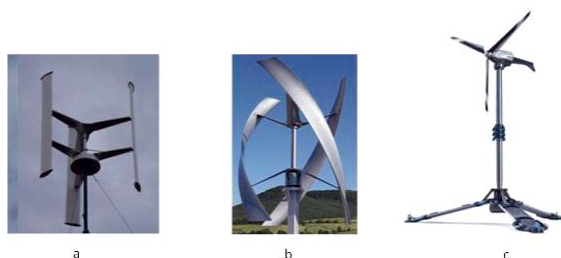
Fig. 4 The most used constructions of wind turbines: a, b - with a vertical axis, c - with a horizontal axis (Kopecký and Rakúsová, 2014)

Recently the wind power engineering has marked a huge development with a yearly increase of output