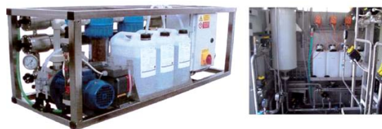
Fig. 5 Mobile versions of water treatment (MSRO 140, SVK - MÚPV 5)