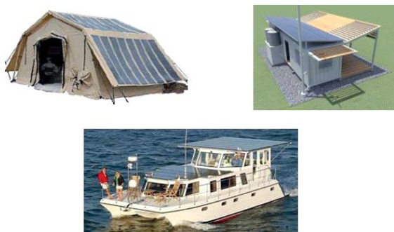
Fig. 3 Examples of using photovoltaic systems on mobile equipment. (Kopecký and Rakúsová, 2014)

One of the most ecological kinds of energies is electric energy obtained through a direct transformation of solar radiation, which has been known since the 19 th century. There is a large excess of solar energy impinging the Earth's surface, however with a low density, and it is featured by a seasonal and daily variability influenced by weather as well. However majority of PV (Photo Voltaic) systems do not need a direct solar radiation.