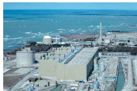
Fig. 2 Nuclear power plant Bruce, second generation type Candu from 1977 (Wikipedia, online)

The process of converting energy in nuclear power plants can be divided into 3 stages. It applies to each generation of nuclear power plant. These stages are: converting the energy of splitting of the atom nuclei into thermal energy, converting the energy into mechanical energy and the last stage is converting mechanical energy into electricity (Ackerman, 1987).