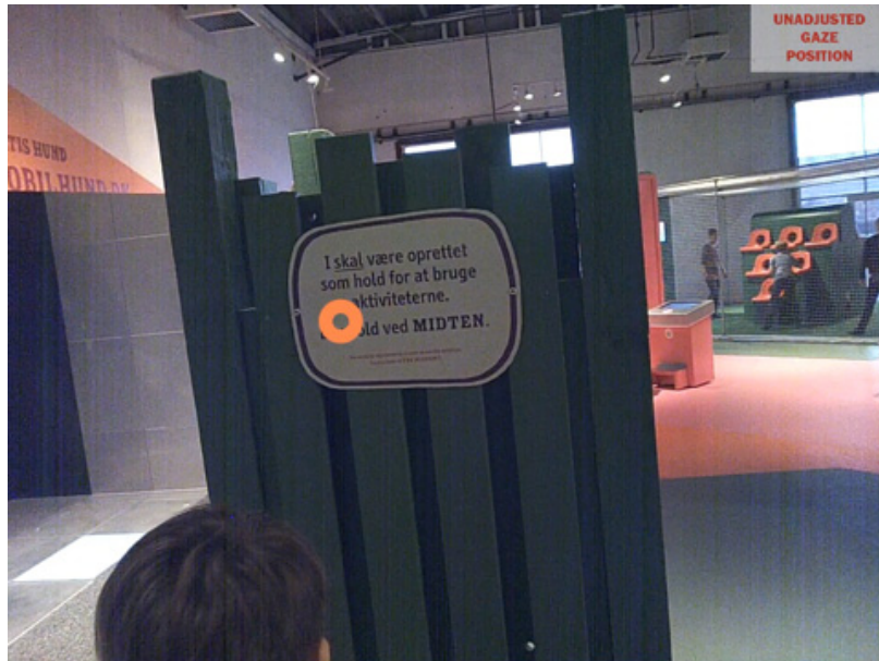
Figure 2: Participant gazing at a sign that explains how to sign up as a team and not the information he said he was seeking. The text on the sign says: “You must be logged in as a team to use the activities. You can create a team in the MIDDLE.”.

Several factors about the setup made this kind of data information possible. First, we allowed the museum visit to be a highly social context in a natural environment. While others have chosen to restrict the visitors to one-at-a-time in an exhibition while using MET (Mayr et al., 2009), this exhibition could only be used in teams, thus every participant wearing MET was accompanied by a team. If the person in figure 2 had been alone he would most likely not have wondered out loud about what to do in the activity. Hence, the social context of the group provided additional auditory data about navigation and rationalisation in the exhibition. Video recordings have been a widespread method for conducting visitor studies (Vom Lehn, Heath & Hindmarsh, 2002), but linking the question of what to do with the gaze point on the sign was only possible with video containing the first-person point of view and basically is not possible with the other method due to the brevity of the gaze. He does not find the information that he sought on the sign and proceeded to the activity with his family, where they spent the beginning of the activity talking about what to do. This information allowed us to present additional findings to the developers of the exhibition by pointing out how to better provide information on finding the way in rather complex activities.