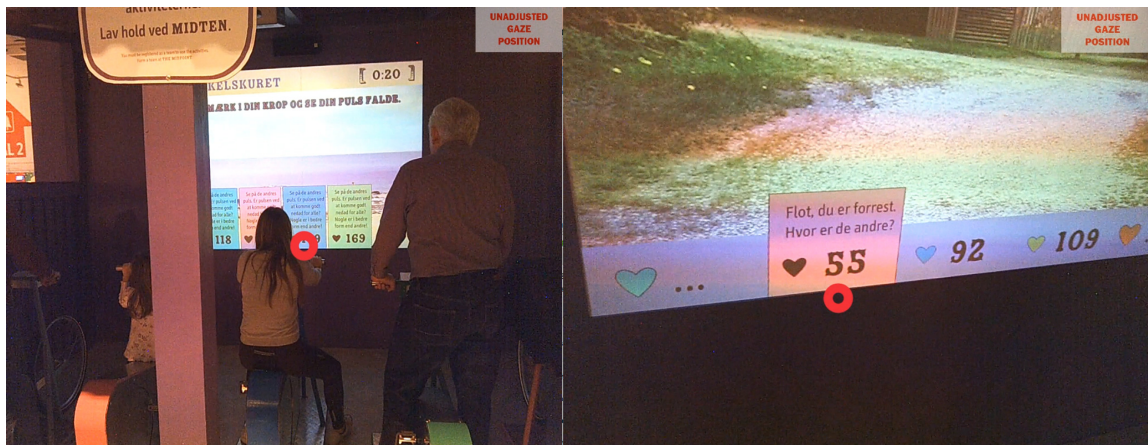
Figure 3: Screen shot from eye-tracking studies of Family 2. The father in Family 2 (wearing eye-tracking glasses) watches another family use the Bike Shed while waiting with his daughters to try it. The text on the screen says "Bike Shed" shows the biking time (0:20) and says "Feel your body and see your PULSE fall." The digits represent the different family members' (various colors) heart rate per minute. The boxes also indicate who has the lead in the virtual bike race.

To investigate the experiences that influenced the girl mentioning knowledge in relation to understanding her own body, data from the family's visit to the bicycle installation (see figure 3) was reviewed to identify the possible sources of information. The family cycled together on four adjacent exercise bikes equipped with sensors in the handlebars to measure their heart rates. In front of the bikes was a large screen showing a film simulating a family bike ride to the beach. Participants were instructed to cycle and then to rest to see how fast their heart rate decreased to a resting rate. Information about who took the lead and the different member's heart rates was also displayed. The eye-tracking studies on Family 2 focused on understanding what influenced building knowledge about the body on the inside and "what you can do that you weren't aware of". Family 2 had three members: a father and two girls, one 6-7 years old and the other 9-10 years old.