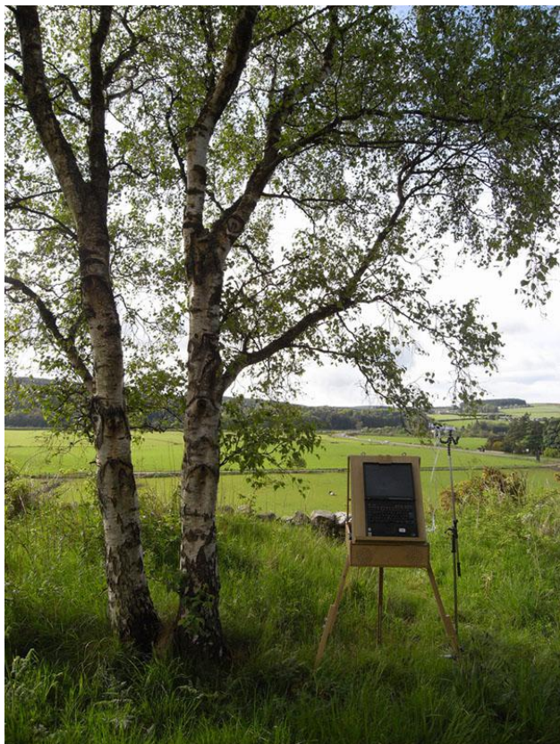
Figure 3: Reiko Goto and Tim Collins, Plein Air , 2010

non-human entities within an experimental aesthetic system. As we breathe out carbon dioxide—both through our physiological process of breathing and our cultural processes of polluting—trees breath it in. By translating these biological processes into a musical form, Collins and Goto's work signals a movement from a process of atmospheric exchange to a digital process of sensing and coding, the output of which is then transmitted through the atmosphere as sound. It must be mentioned that within this movement from atmospheric gas to atmospheric music we are not listening to the tree alone. We are listening to a much more complex polyphony involving the components of the digital sensing technology, the tree, the gases in the atmosphere, and the biological (breathing) and cultural processes (cars, factories and coal fired power stations) that produce these gases.