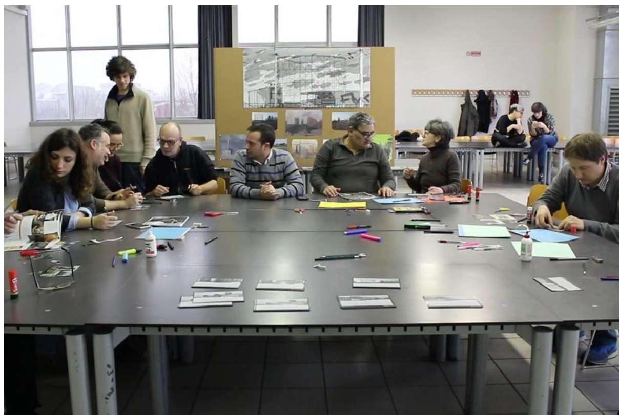
Figure 5 – Plug Social Workshop “Bovisa 2115. Cartoline dal futuro” (Postcards from the Future), Milan, 30th January 2016.