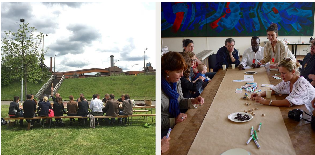
Figure 3 - Seraing, May 2015 - Codesign sessions