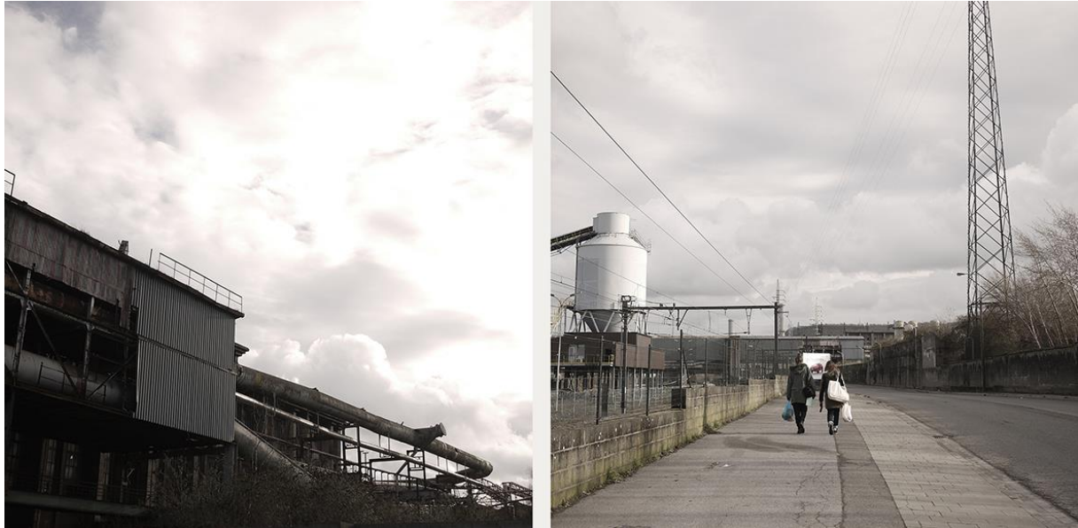
Figure 1 - Images from the explorations in Seraing.

Seraing is a town near Liege, Belgium. After a glorious industrial past, now Seraing faces the closure of all the factories, a stellar unemployment and the lack of public spaces. (Figure 1) Invited by the local municipality, our group of designers had the objective to study, listen and observe the neighborhood. We had to try to understand the problems and difficulties, build opportunities for interaction and dialogue between citizens, associations, local administrators. In a place often perceived as hopeless, we had to imagine possible futures.