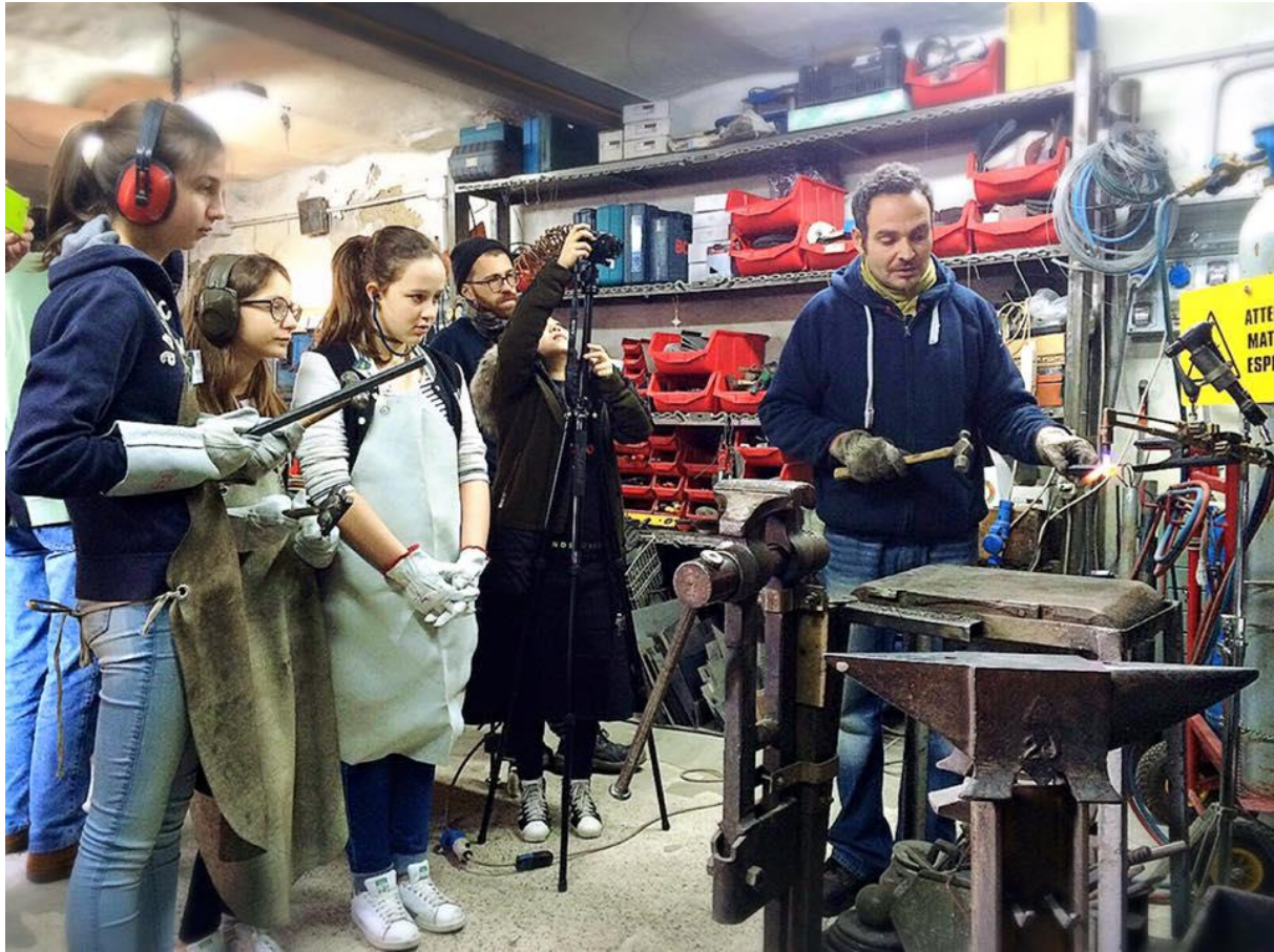
Figure 6 – Plug Social Workshop “ArtiGianni. Dal lavoro manuale alla stampa 3d” (From handicrafts to 3D printing), Milan, 30th January 2016.