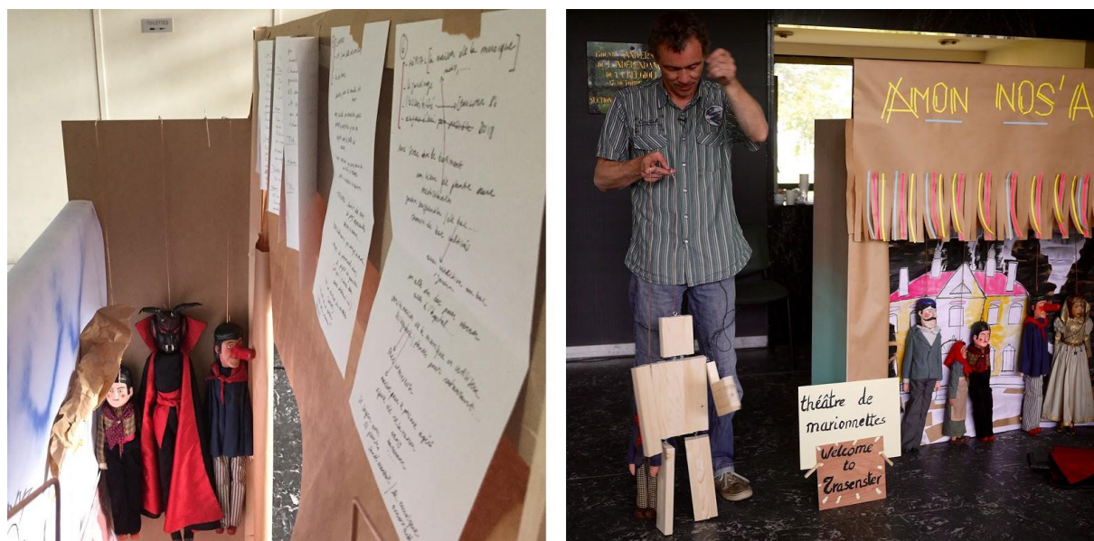
Figure 4 - Seraing, May 2015 - Images from the puppet play.