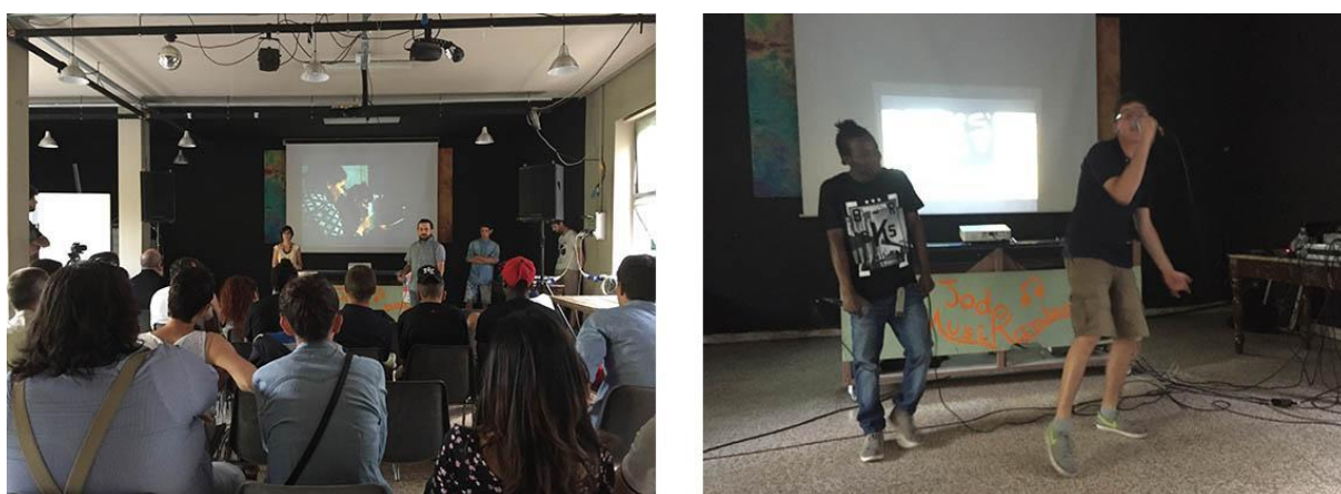
Figure 5. End of June 2015 - At Jodok (Olinda, Milan) presenting the Videoclip, a backstage of the making of the film and playing with music, words and dance

Later in that Summer and in September, we researchers and the educators from CAG Abelia met again, to analyse the work done and understand how to develop further the collaboration. Overall, the educators were happy about the experience, particularly they could sense that, even though the teenagers were not expressing it directly, the workshop was a good social experience: