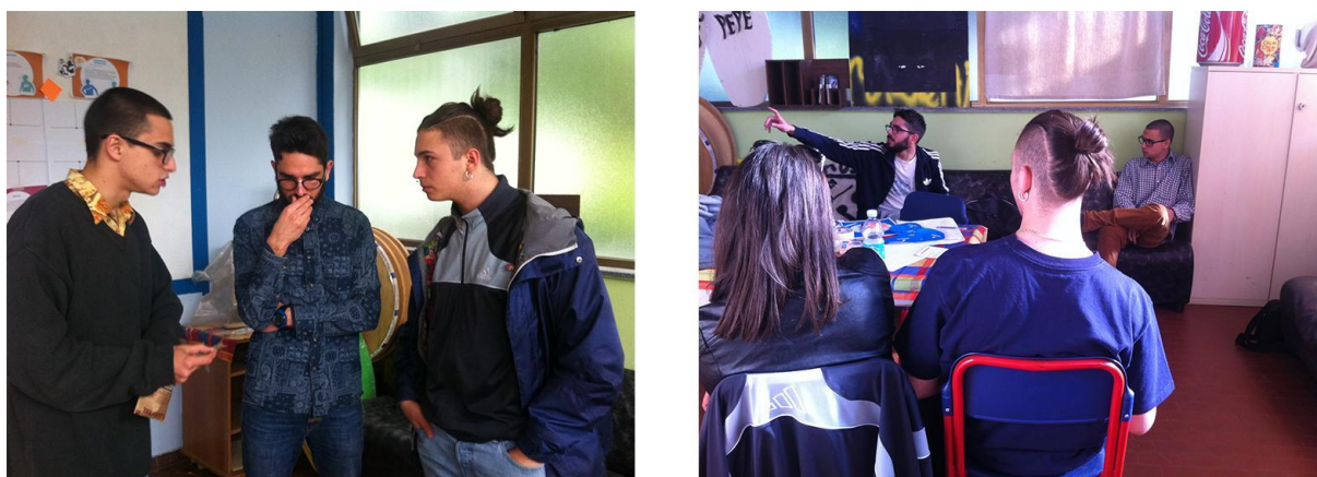
Figure 6. The first meeting focused on the definition of the goals of the format and its target audience.