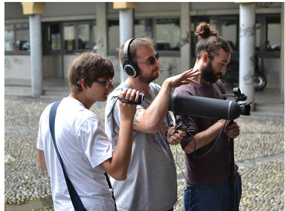
Figure 9. The emergent artist La Haine walking around the neighbourhood letting people listen to his songs while being filmed and recorded from the other participants.