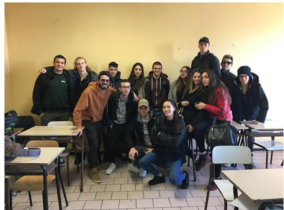
Figure 10. The model developed with the campUS Social TV being used for other educational activities with secondary school students.