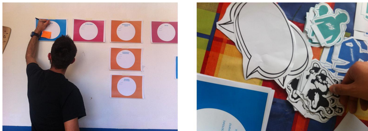
Figure 7. Organising the different sections of the format using specific design tools.

The paper format, such as the document which defines all the creative and productive elements of the format itself, represents, on the one hand, the result of the co-design activities with the participants of the project (young rappers and educators), and, on the other hand, it can be considered as a form of prototype, including the writing and the pre-production phase which are necessary for producing episodic audiovisual contents. The paper format represents, in fact, the basis for defining characters, roles, timing, duration, location, and specific objects which are necessary for producing and post-producing each episode. It represents the first development of an idea and it verifies its feasibility.